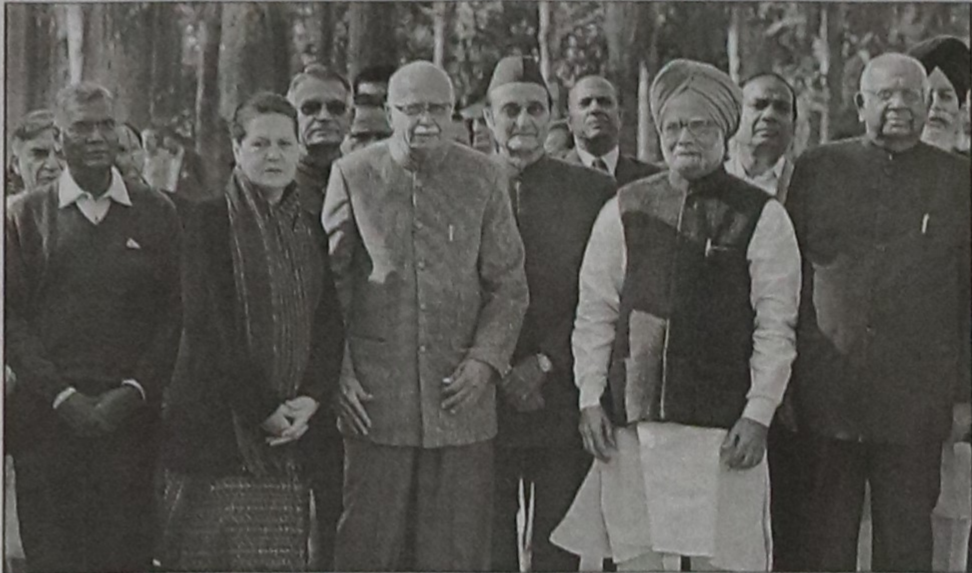
Indian Prime Minister Manmohan Singh (2R), Leader of the Opposition and Bharatiya Janata Party (BJP) Prime Ministerial candidate Lal Krishna Advani (4R), Congress Party President Sonia Gandhi (2L), Communist Party of India (CPI) National Secretary A Raja (L) and Parliament Speaker Somnath Chatterjee (R) stand during a remembrance ceremony of the 2001 Parliament attack at the Parliament House in New Delhi yesterday. Indian parliament was turned into a virtual fortress as politicians gathered to observe the seventh anniversary of a bloody militant attack on the complex, which left 14 dead on December 13, 2001.