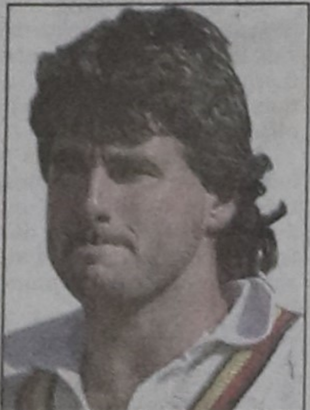
Allan Lamb (Former England cricketer) "Ian Botham was my best roommate. I never saw him."