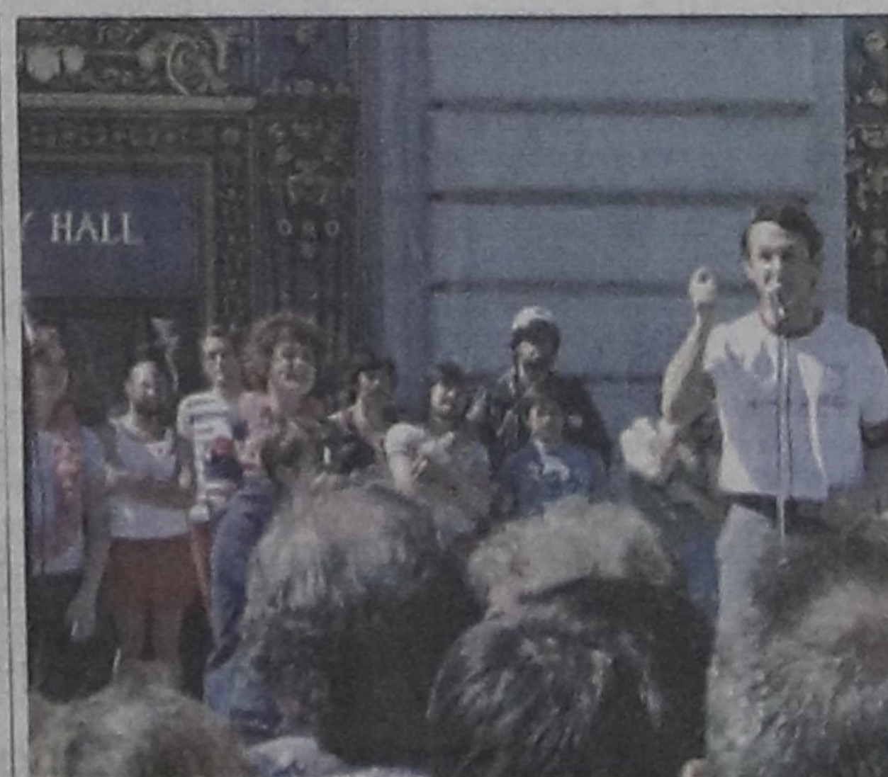
Sean Penn (right) in "Milk", one of the films that despite creating a buzz has been snubbed by the Golden Globes.