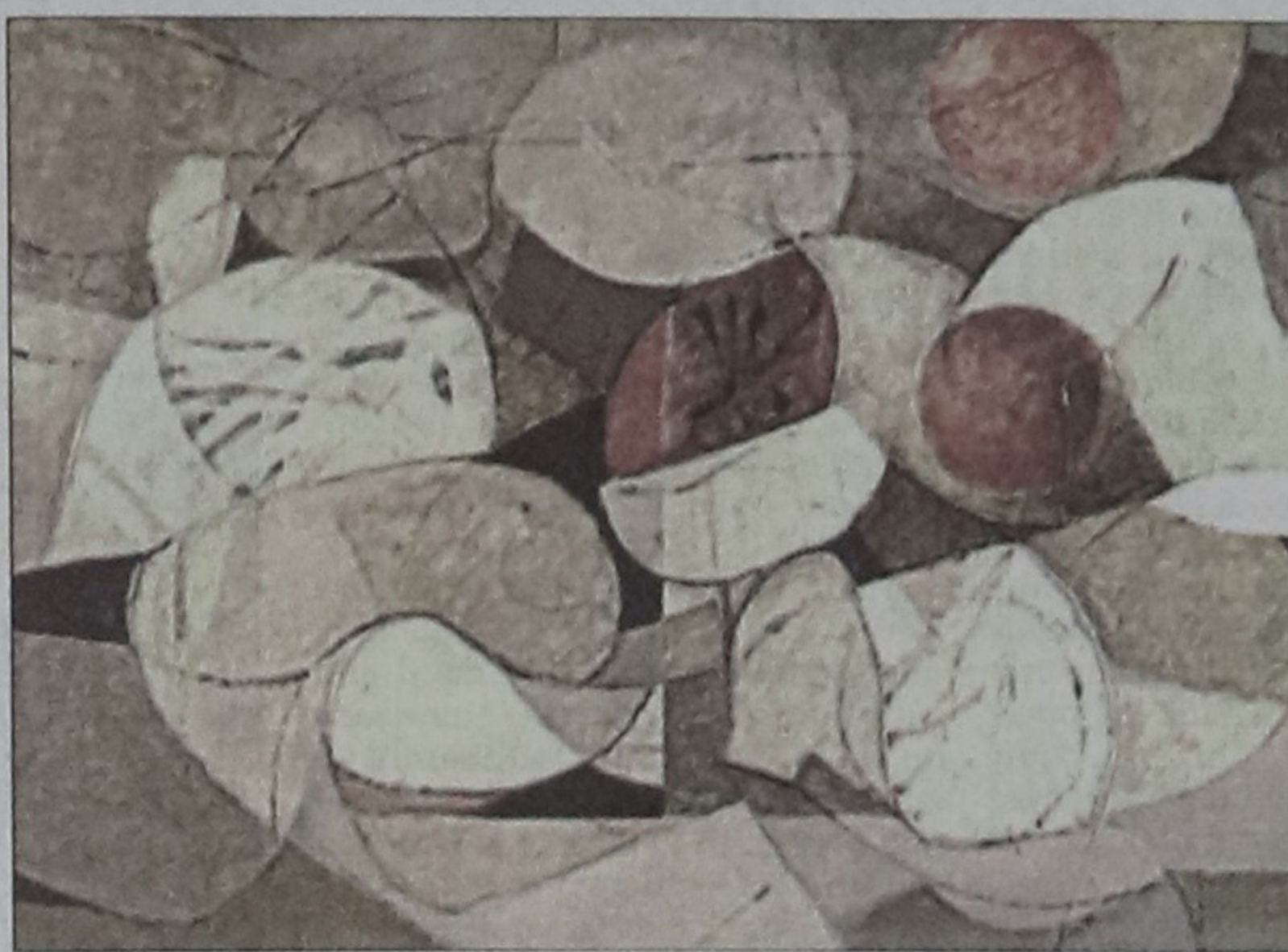
Clockwise (from top-left): Works by Fernando Amorsolo, Jose Joya and Juan Luna.

1898. The first generation of Filipinos, born in the 20th century, produced a number of gifted painters. During that time, subject was more significant than medium or technique. The themes were mainly landscape, portrait, social injustice, urban and rural life in Philippines. The National Museum of the Philippines is famous for its spacious and roomy atmosphere where one building contains the works of Filipino master painters; the other is devoted to the works of promising and budding contemporary painters.