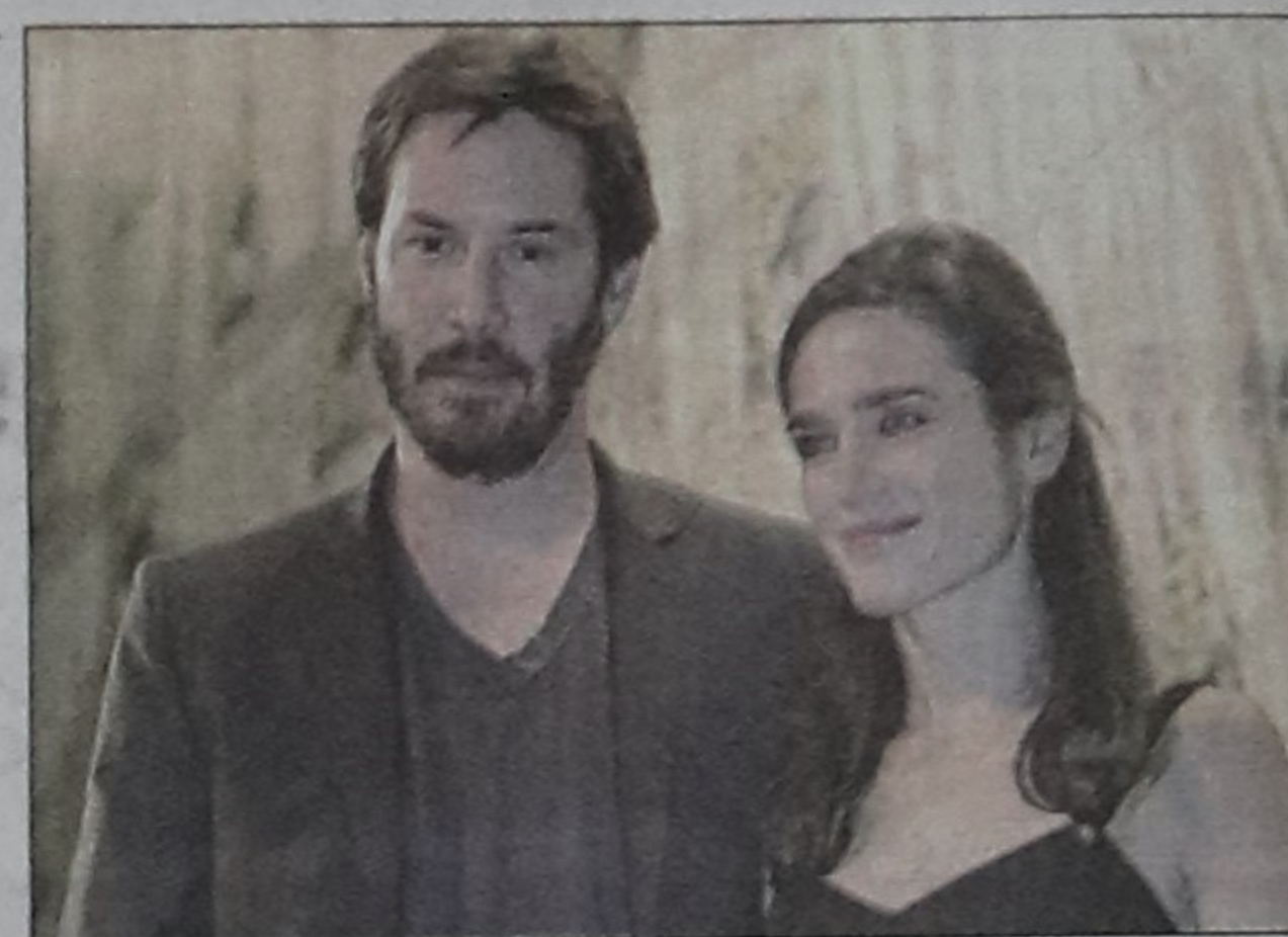
Keanu Reeves and Jennifer Connelly play the lead roles in "The Day the Earth Stood Still".

He also admits to being "a bit of a loner, at least some of the time...I'm really happy getting on a motorcycle and just riding alone across France like I did last summer. No one bothered me and I had a great time."