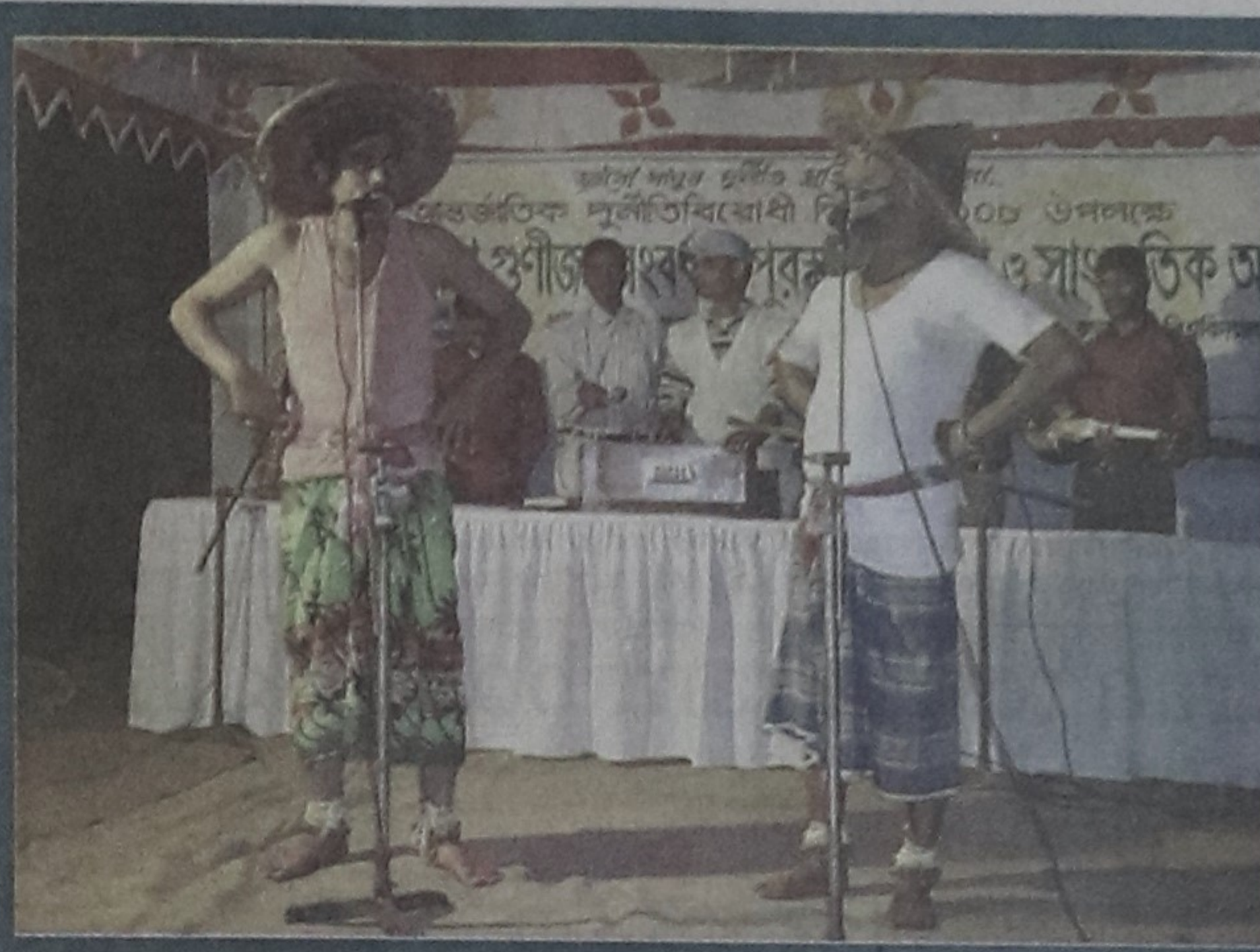
Artistes perform Traditional "Gombhira" songs on International Anti Graft Day in Chapainawabganj recently. To mark the day, a colourful rally, discussion, prize giving ceremony and cultural programme were held. Sachetan Nagarik Committee, Chapainawabganj, a unit of Transparency International Bangladesh (TIB), organised the event.

The article is a reprint of an earlier version.