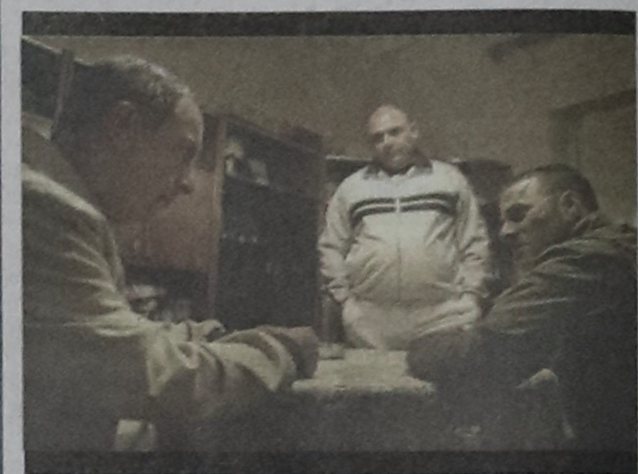
A scene from the film "Gomorra".

Honorary awards were presented to British actress Judi Dench and the founders of the Dogma film movement, Soren Kragh-Jacobsen, Kristian Levring, Lars von