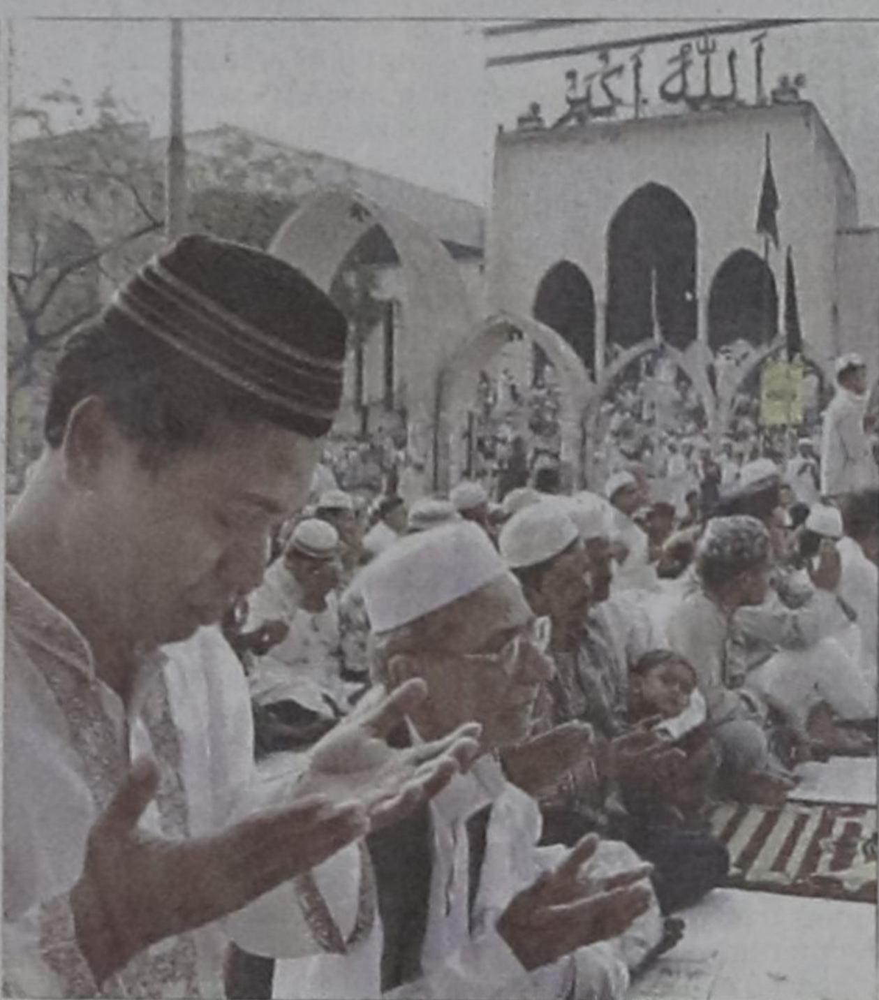
Devotees pray in front of Baitul Mukarram National Mosque in the capital on the Eid day, failing to find room inside the mosque.