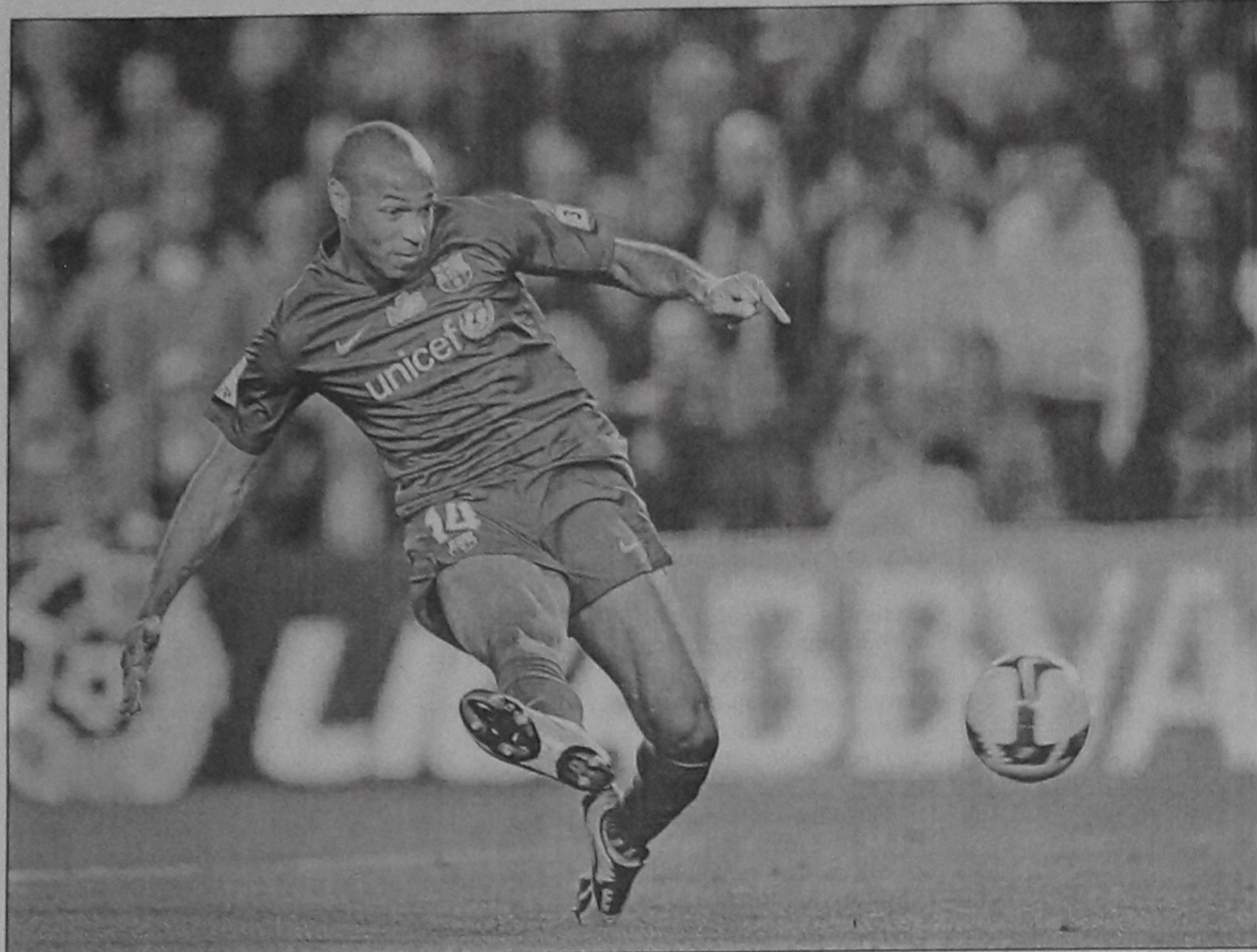
HATTRICK HERO: Barcelona striker Thierry Henry scores his second goal in their 4-0 rout of Valencia during their Primera Liga encounter at Nou Camp on Saturday.