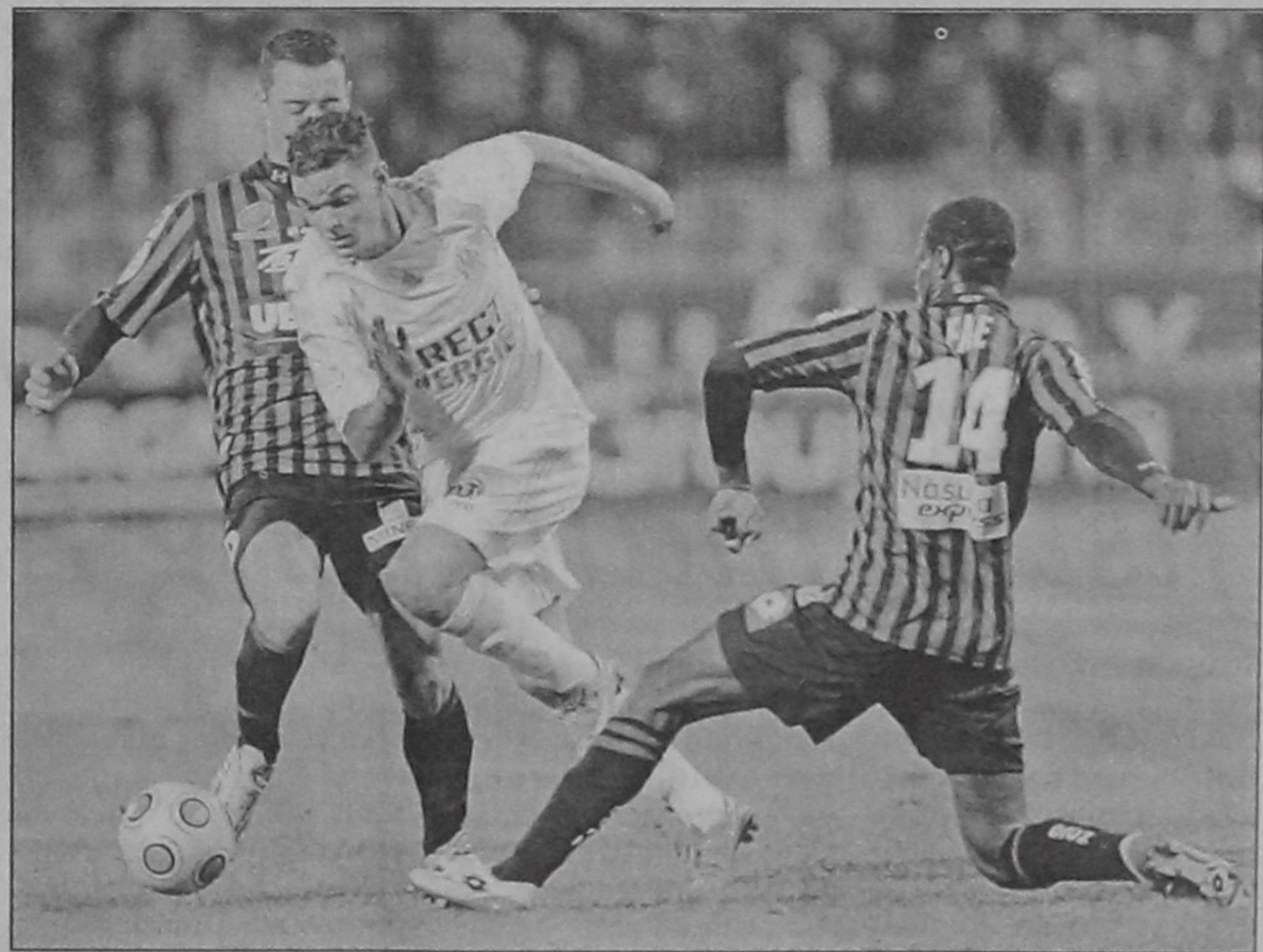
Marseille forward Hatem Ben Arfa skips his way through Nice players during their League One tie at the Velodrome Stadium in Marseille on Saturday.