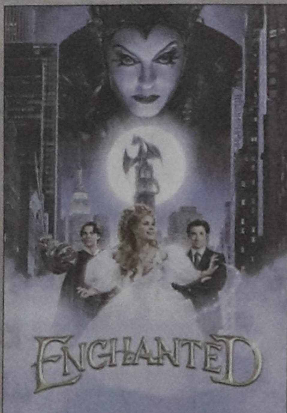
On Star Movies at 7:00 pm Genre: Musical Cast: Amy Adams, Patrick Dempsey, James Marsden

Radio Foorti 88.0 FM 08:00am Saturday Morning Show 12:00pm Bolyer Poka 02:00pm Foorti Unlimited 07:00pm Celebrity on The HotSeat 10:00pm Back to Back music Radio Today 89.6 FM 07:15am Good Morning Dhaka 11:00am Masti Unlimited 01:00pm Saturday World Music 04:00pm U-Turn 08:00pm Top of The Week 11:00pm Raat Vor Gan 02:00am Back to Back