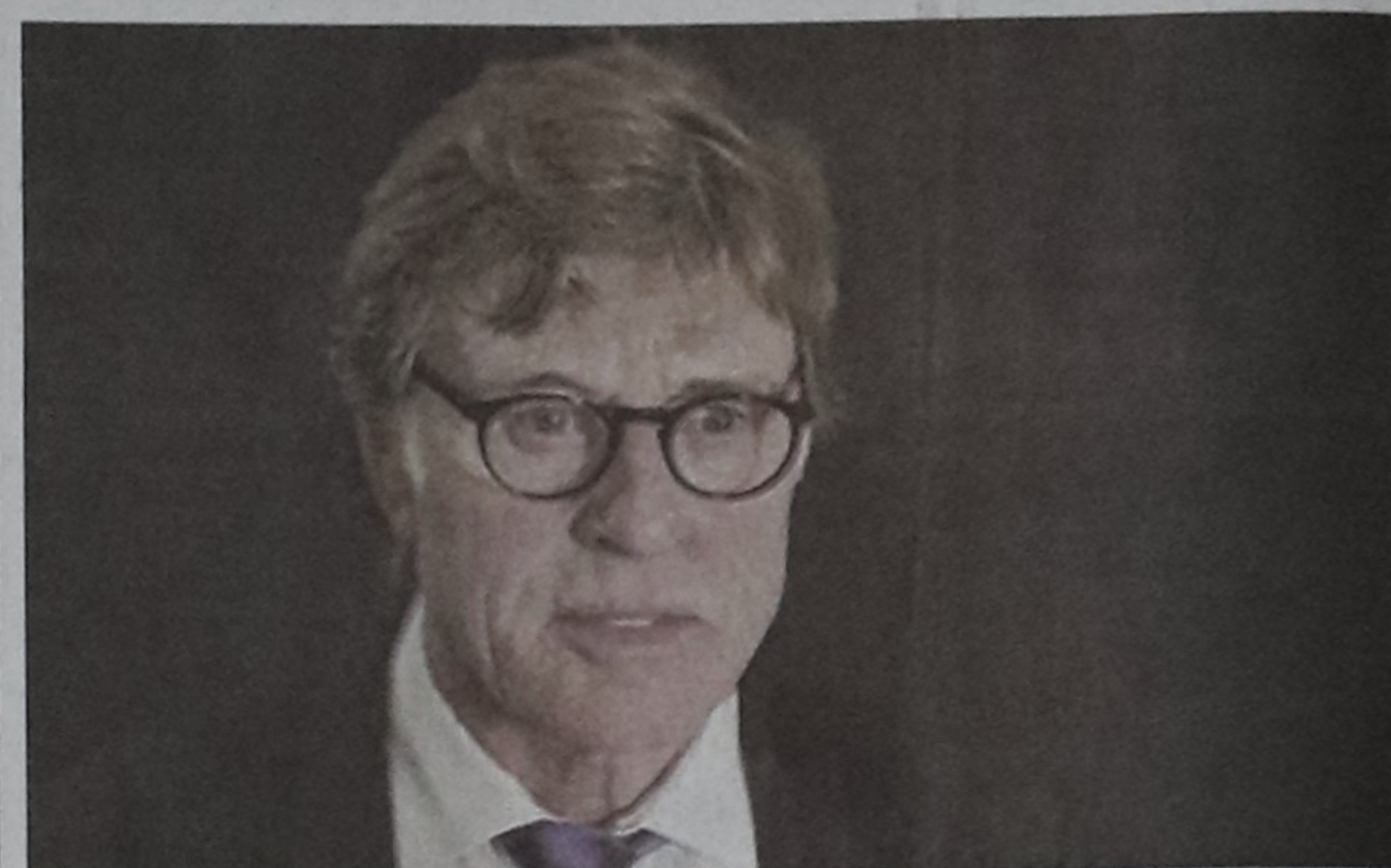
The festival is backed by Robert Redford's Sundance Institute for filmmaking.