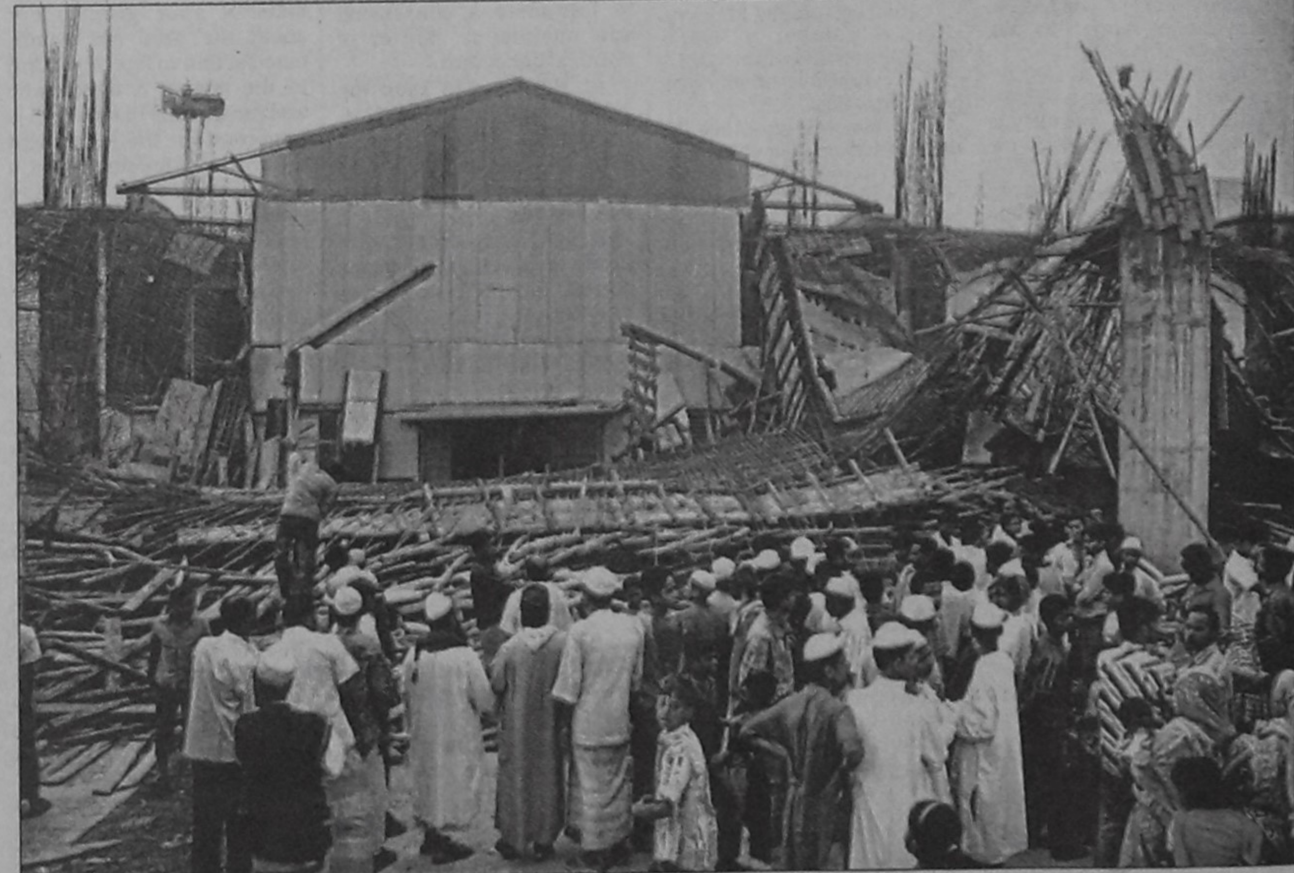
Debris of the under-construction mosque in Uttara in the capital that collapsed yesterday, leaving at least 40 workers injured.