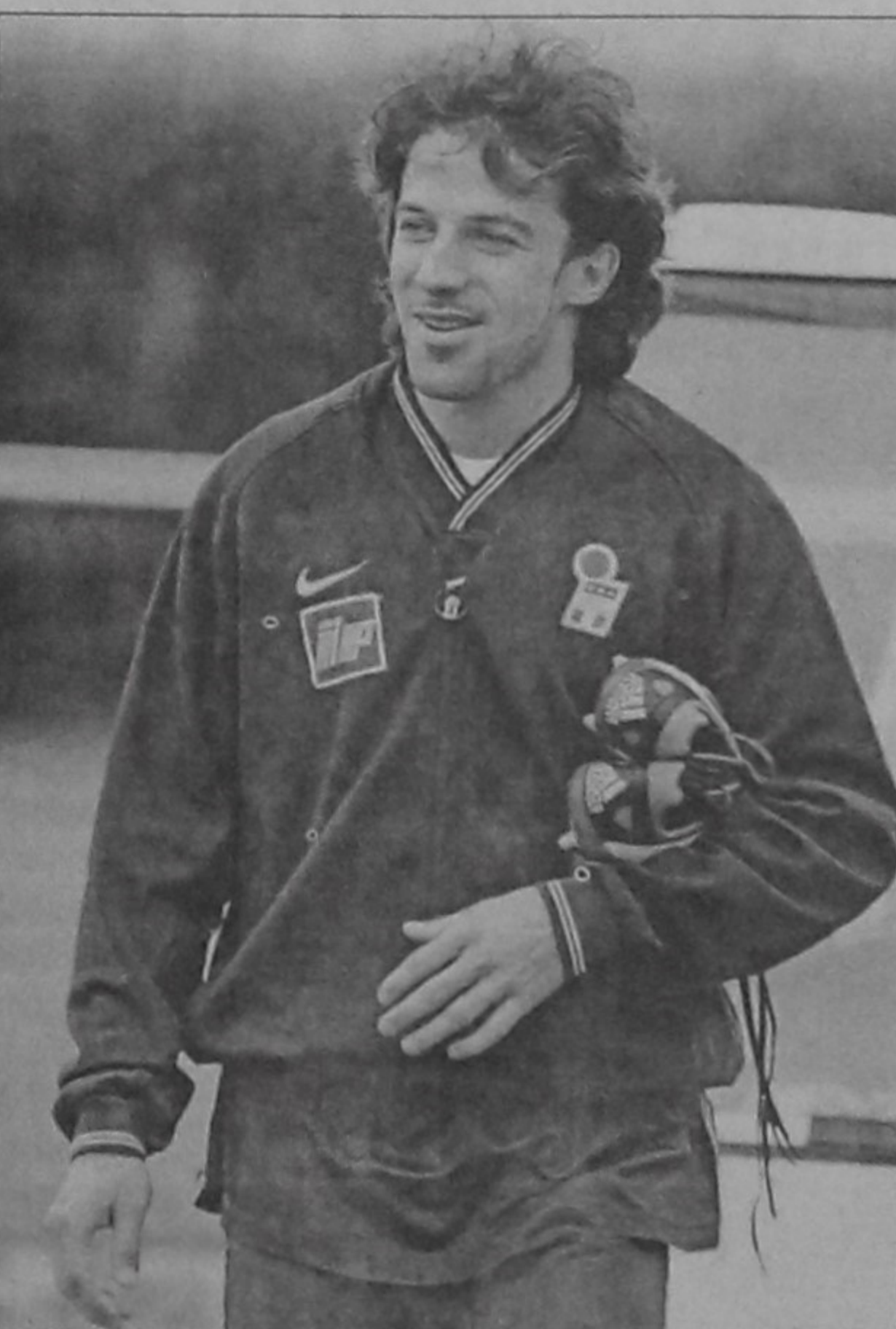
ALESSANDRO DEL PIERO

"Lippi also has to consider young talents but when he believes the moment is right, he'll call him (Del Piero) up again."