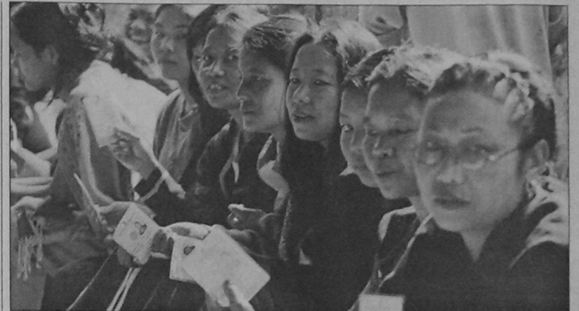
Voters from Northeastern India's Mizo ethnic group hold their voters identity cards as they wait to cast their ballots at a polling station in Aizawl, the capital of Mizoram yesterday.

"I am again telling you that Pakistan will act very responsibly, and we have talked to all our friends that they will use their good offices to defuse the situation."