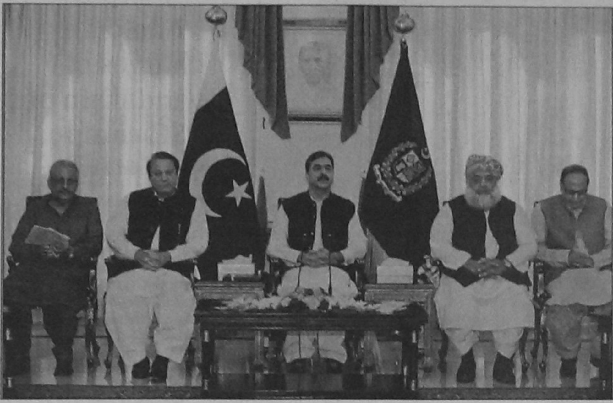
Prime Minister Yousuf Raza Gilani (C) speaks during the National Security Conference held in Islamabad yesterday to develop a joint response to the current tension with India in which all political parties participated. Pakistan's foreign minister Shah Mehmood Qureshi said that his country had offered investigators to help India probe the Mumbai attacks.