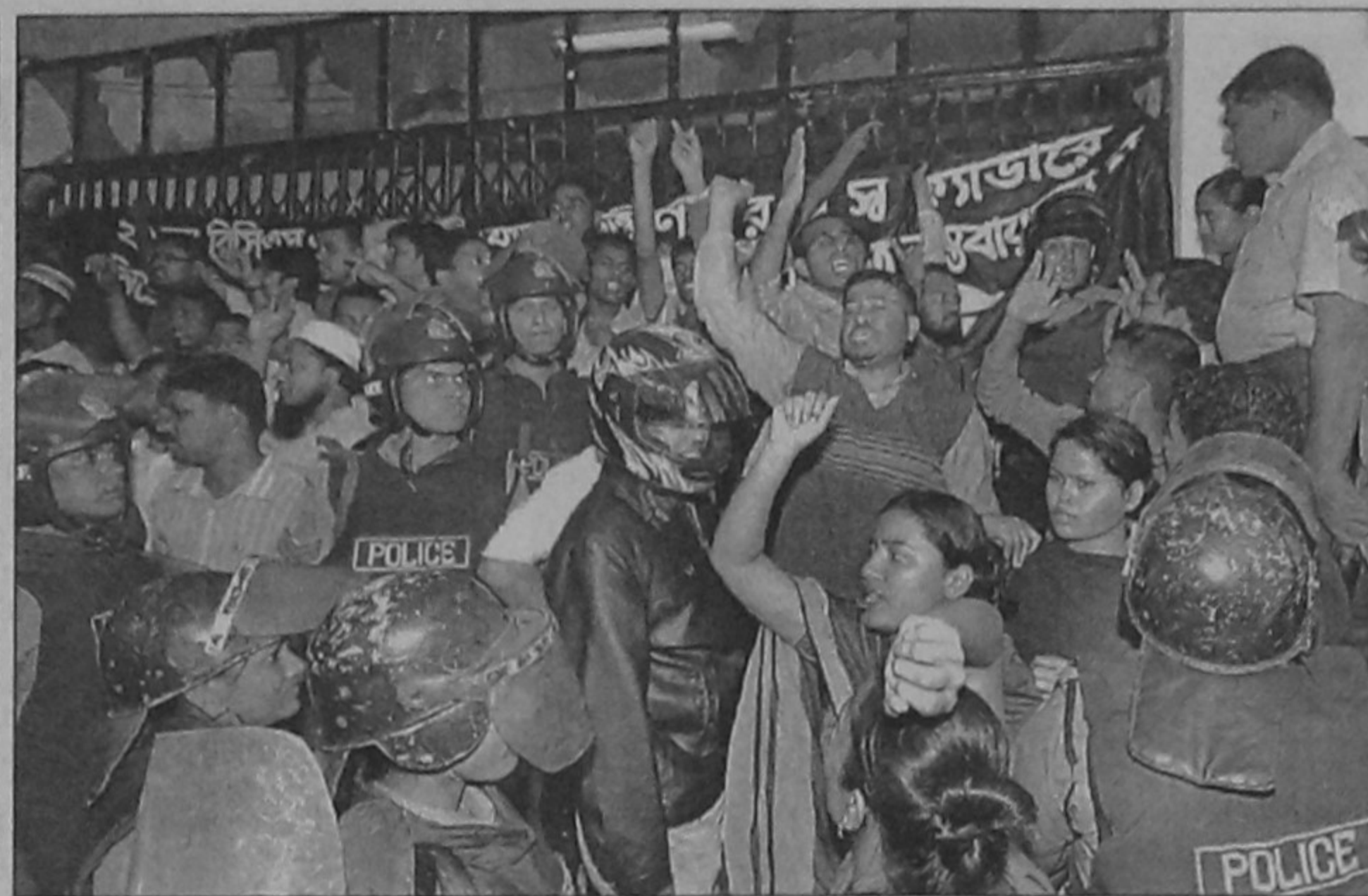
Candidates of the 27th BCS examinations stage a demonstration at the Public Service Commission office in the city yesterday demanding their immediate appointment. These candidates passed the exams at first but were dropped from the list of successful candidates as per the second phase results.