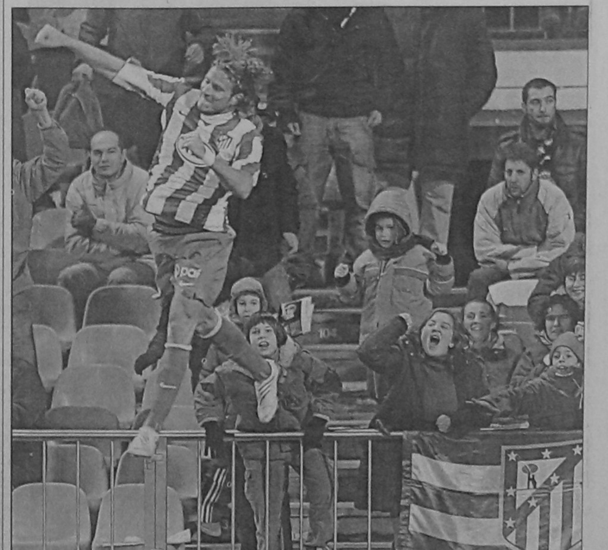
Atletico Madrid striker Diego Forlan jumps for joy after scoring a goal against Racing Santander during their Primera Liga tie at the Vicente Calderon Stadium in Madrid on Sunday. Atletico Madrid won 4-1.