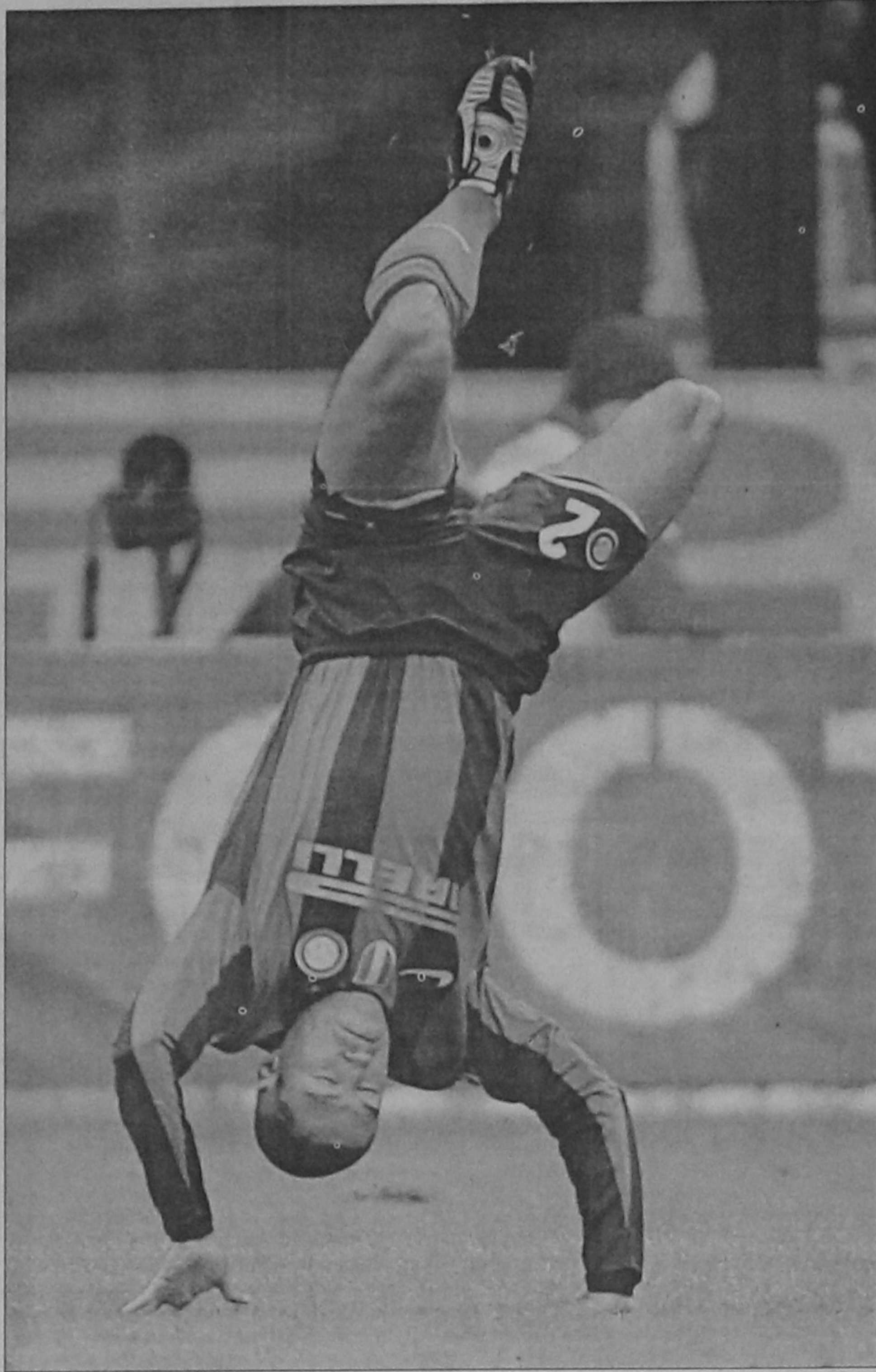
Inter Milan defender Ivan Cordoba performs a somersault after scoring the opening goal against Napoli during their Serie A clash at San Siro on Sunday.

As well as Fiorentina missing out on moving into the top four, Lazio lost 2-0 at Atalanta, Genoa drew 1-1 at home to Bologna and 10-man Udinese fell 1-0 at home to rock bottom Chievo.