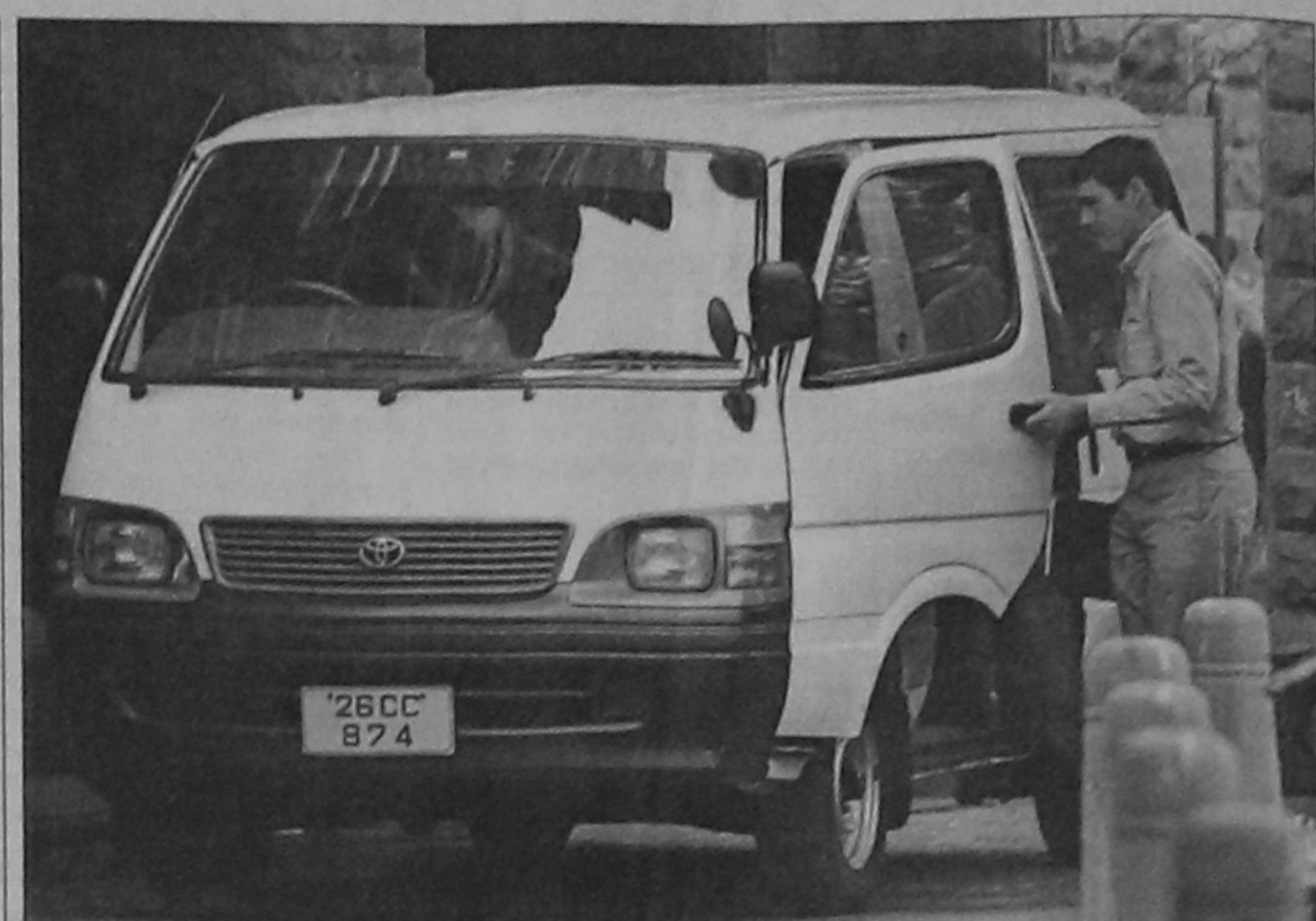
An un-identified Federal Bureau of Investigation (FBI) member leaves State police headquarters in Mumbai yesterday. A 16-member Federal Bureau of Investigation (FBI) team arrived in the city to help investigate the coordinated Mumbai attacks.

"In the early hours of December 1, the security authorities handed control of the Taj Mahal Palace and Towers back to the Taj Group," a statement read.