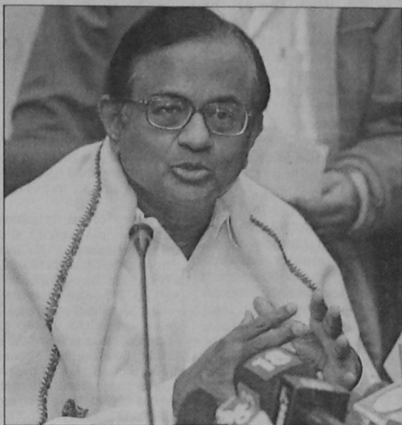
India's newly-appointed Home Minister Palaniappan Chidambaram addresses a press conference in New Delhi yesterday. India's government reassured the nation the economy was in safe hands after Premier Manmohan Singh took over the top finance job following the deadly assault on Mumbai's financial capital.

"It's all right for Muslims to set the infidels' castles on fire, throw them with water ... and take some of them as prisoners, whether young or old, women or men, because it is one of many ways to beat them," he wrote in the al-Fallujah forum.