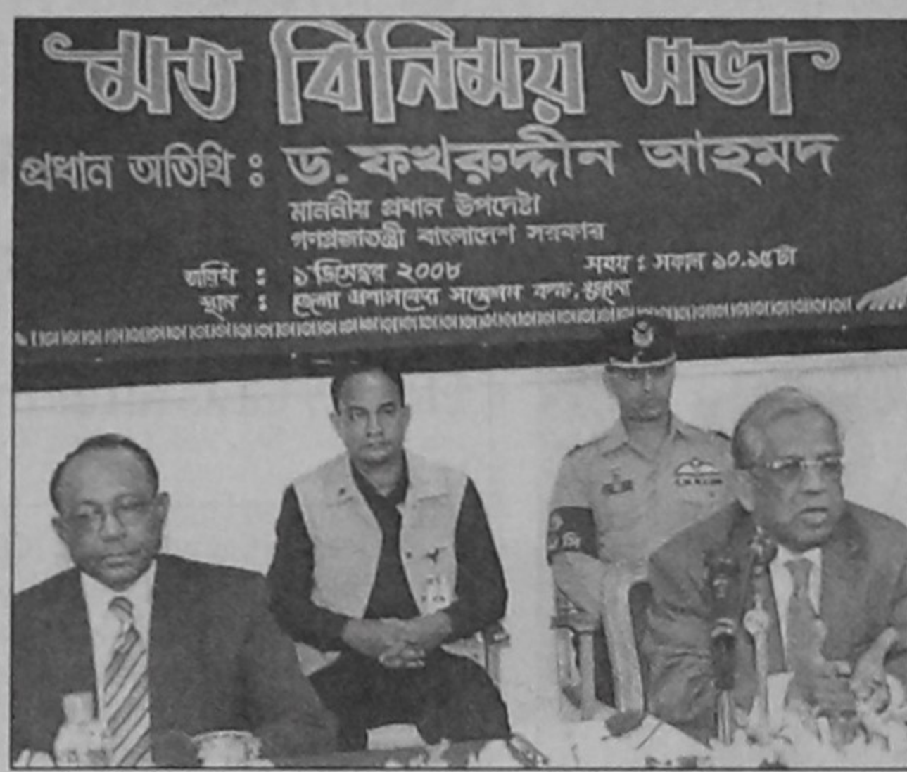
Chief Adviser Fakhruddin Ahmed speaks at a view exchange meeting with the government officials in Khulna division at the Deputy Commissioner's conference room in Khulna yesterday. (Story on Page 1)