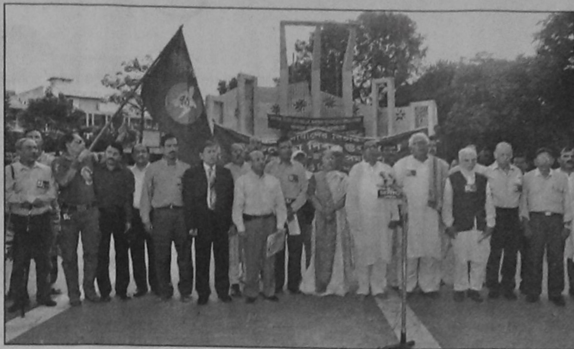
Leaders of Sector Commanders' Forum and other organisations sing national anthem at a programme marking the Freedom Fighters' Day at the Central Shaheed Minar in the city yesterday. (Story on Page 16)