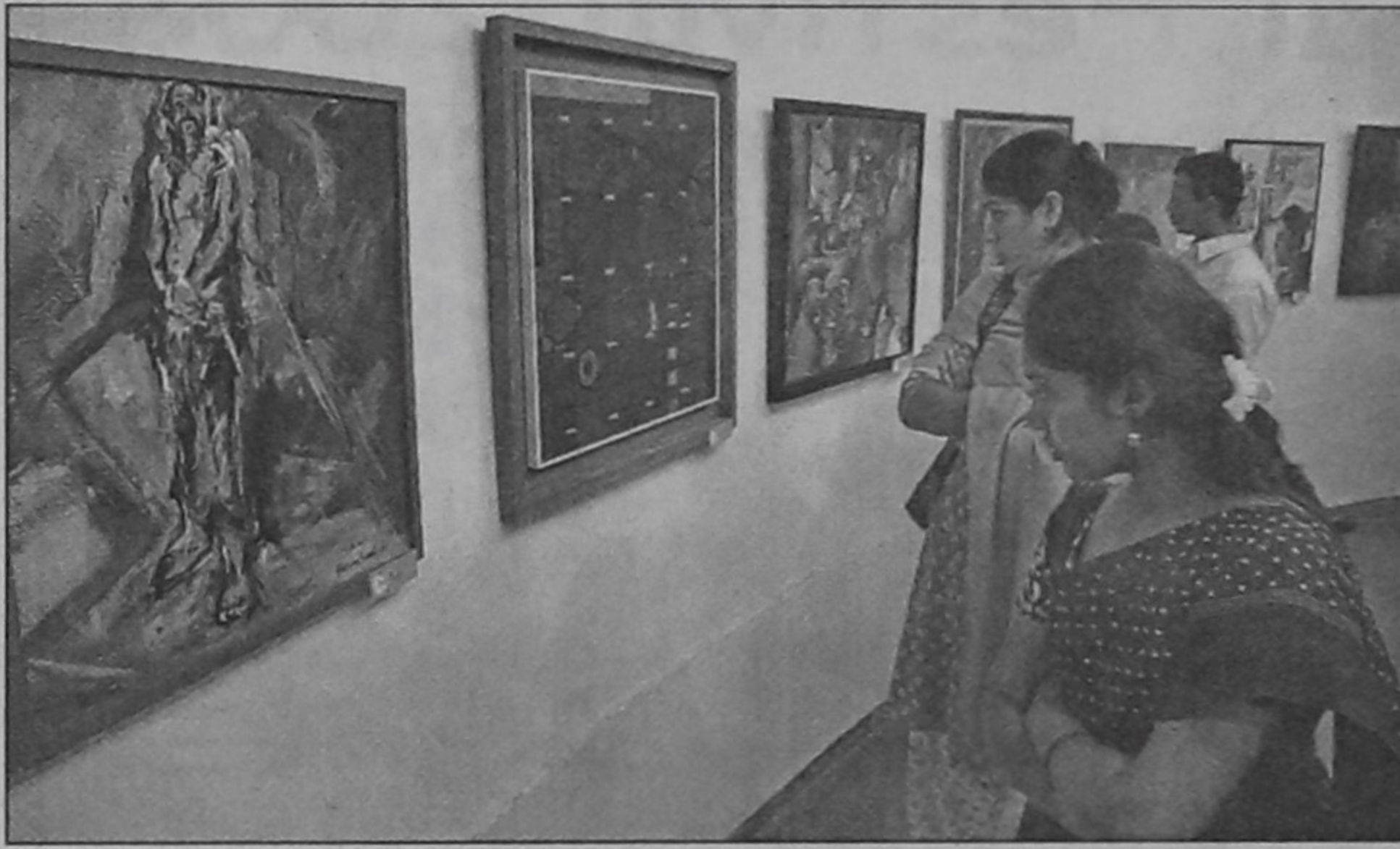
Visitors admire paintings put on display at an exhibition titled 'The 13th Berger Young Painters' Exhibition' at the Zainul Gallery of Fine Art Institute on Dhaka University campus yesterday.

The students and the faculty members of State University of Bangladesh (SUB) formed a human chain to mark the day.