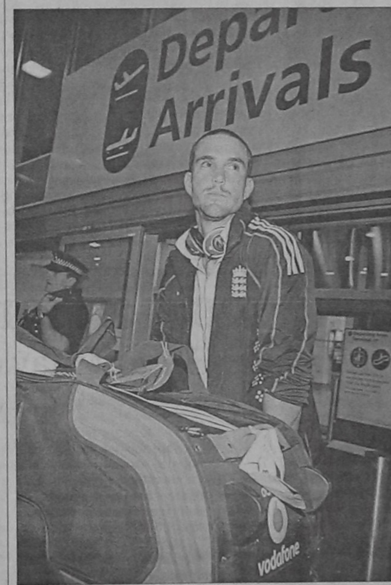
England captain Kevin Pietersen arrives at the Heathrow Airport on Saturday.

"If the Middlesex players had been involved... if they had checked into the Taj hotel 24 hours earlier... and if some of their guys had been held hostage, would this Test series be going ahead? Almost certainly not."