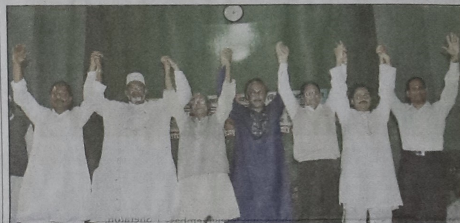
Rajshahi city Mayor AHM Khairuzzaman Liton, centre, introduces six Awami League nominees for constituencies in the district at a meeting of grassroots AL leaders yesterday as nomination deprived party leaders continue agitation.

On the other hand Ashiqur Rahman was elected MP in Rangpur-5 constituency in 1996 in the by-election. Later he was made a state minister. Tipu Munshi was defeated by JP candidate Karim Uddin Bharsa in Rangpur-4 constituency in the 2001 election.