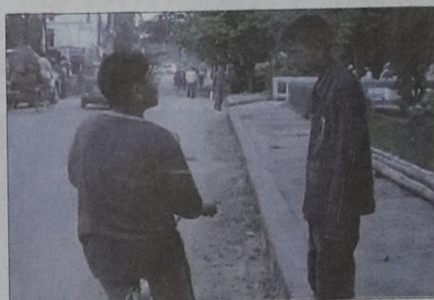
Bicycle Shohor On Channel-1 at 2:30 pm Best debut fiction at Standard Chartered-The Daily Star Celebrating Life 2008 contest Directed by Abdullah Mohammad Saad