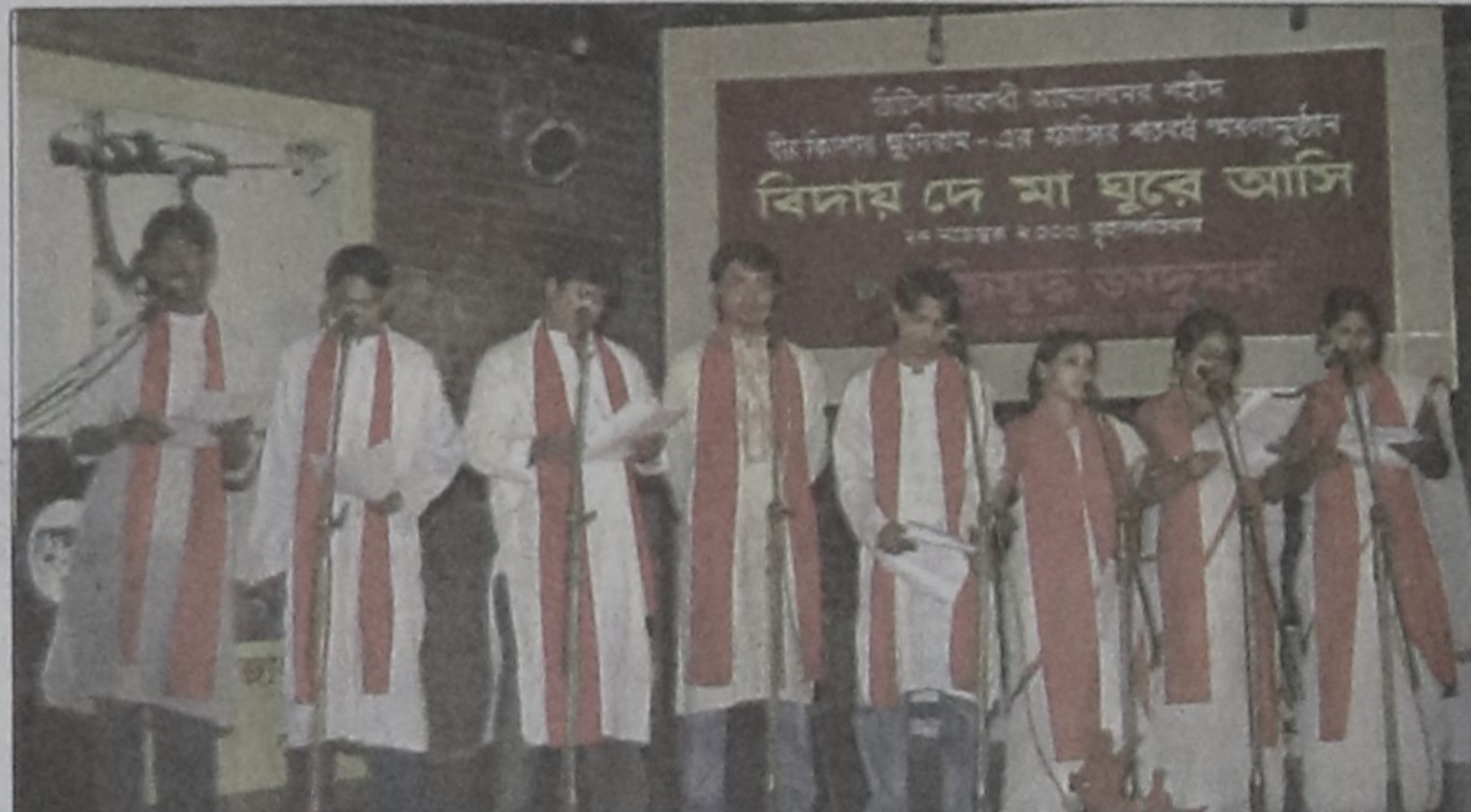
Poetry recitation (top) and dance at Liberation War Museum on the occasion.

Born on December 3, 1889, Khudiram was passionate about his motherland from a young age and was concerned about the