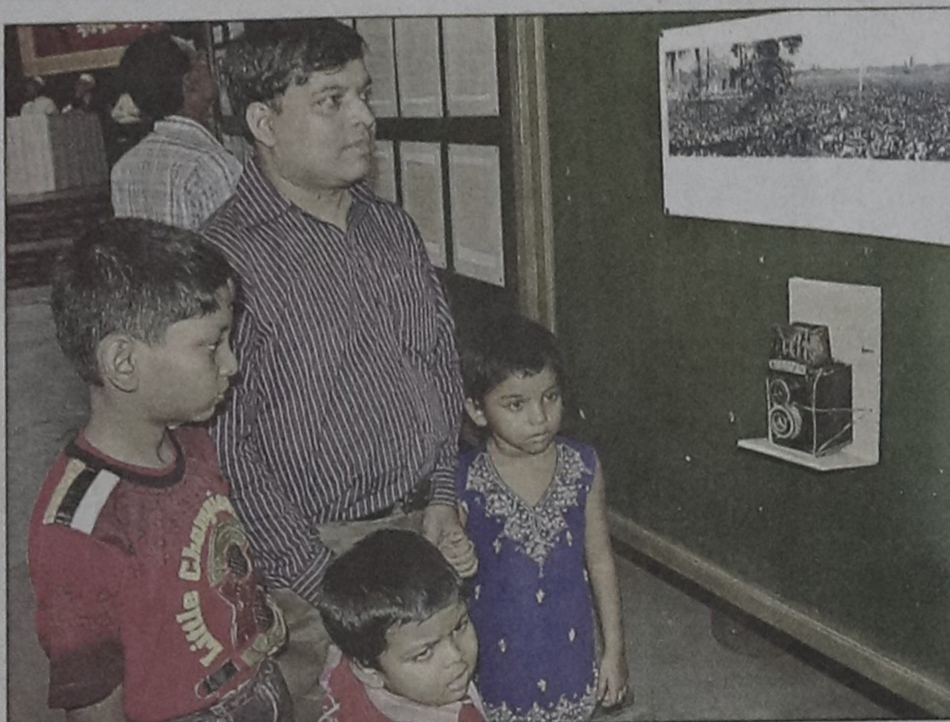
Visitors take a look at memorabilia of the liberation war put on display at Liberation War Museum in the city. Several freedom fighters handed over the memorabilia to the museum authorities at a function yesterday.