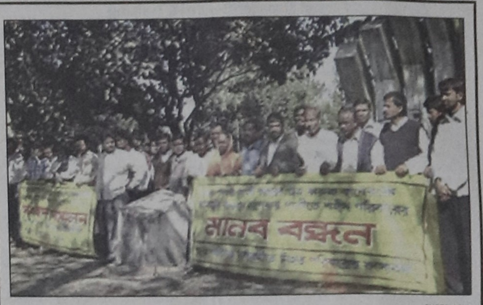
Family members of 1971 martyrs form a human chain at Kaliganj killing ground in Jaldhaka upazila yesterday demanding cancellation of nomination to the 'massacre mastermind's son for Nilphamari-3.