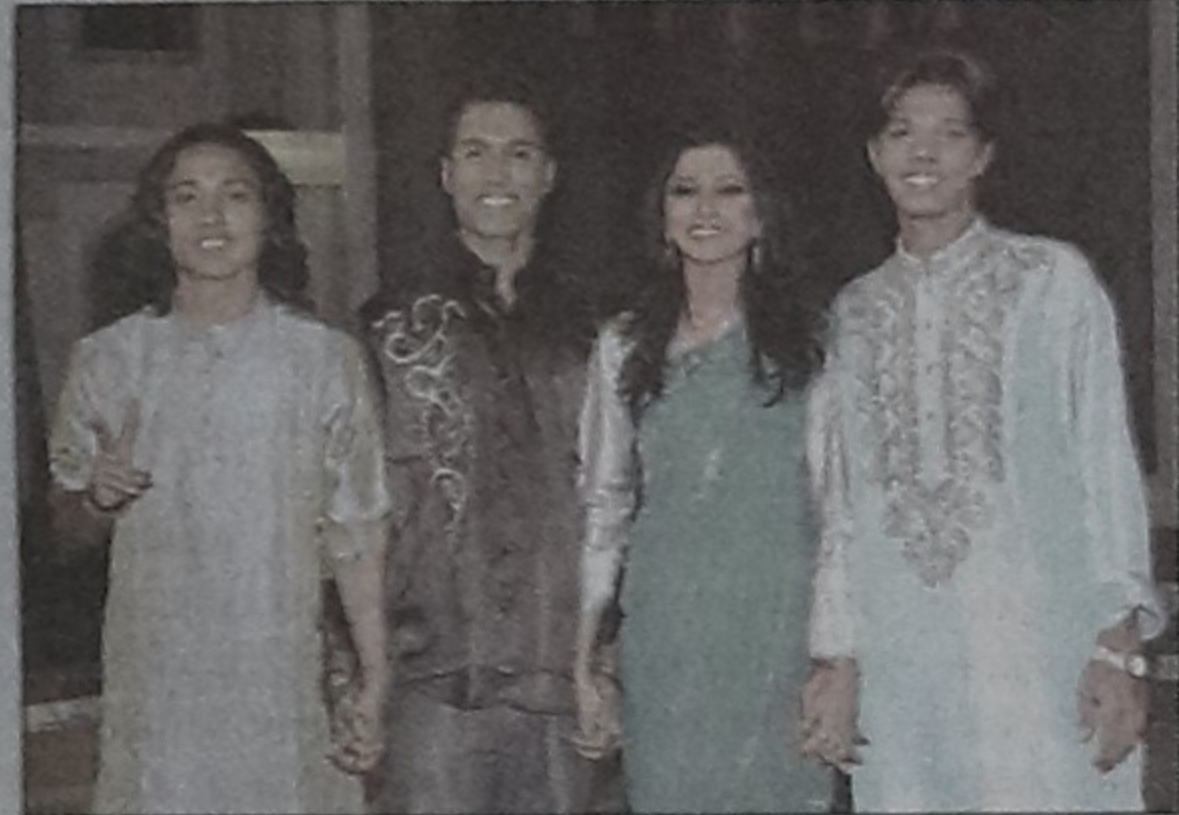
Top four contestants of "Close Up 1".

Tonight's programme will also feature the 40 contestants who were qualified for the sms round. Noted music composer Ahmed Imtiaz Bulbul, artistes Fahmida Nabi and Partha Barua will be present as the regular judges.