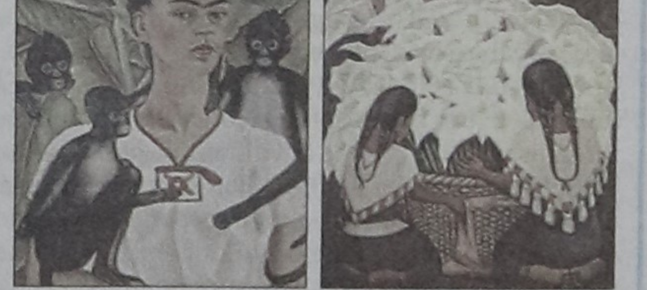
The Gelman collection of art includes Frida Kahlo's "Self-Portrait with Monkeys" (left) and Diego Rivera's "Calla Lily Vendor".

At the time of her death the collection consisted of 95 pieces, including two well-known 1943 works by Kahlo, "Self-Portrait as a Tehuana (Diego on My Mind)" and "Self-Portrait