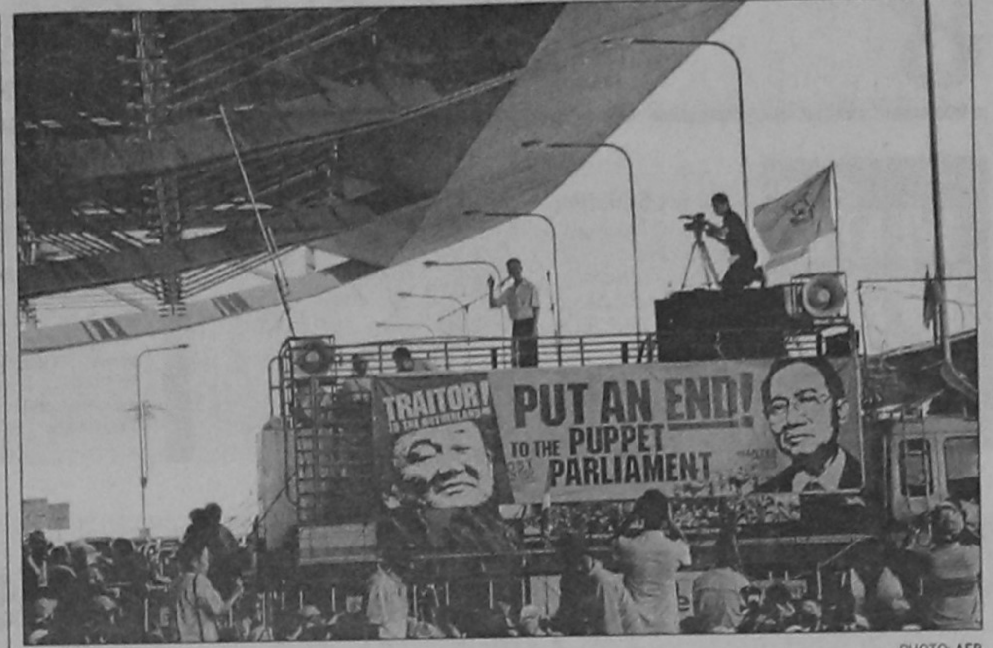
Thai opposition People's Alliance for Democracy (PAD) leader Chamlong Srimuang (C) addresses Thai anti-government supporters from a truck adorned with posters against ousted prime minister Thaksin Shinawatra at Bangkok's international airport on the third day of its occupation on Thursday.

Heavy fighting raged on the outskirts of Kilinochchi on Thursday despite monsoon rains, military officials said, adding that troops were poised to breach new defences built by the rebels.