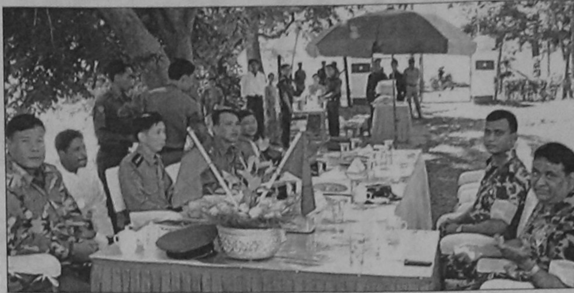
A battalion commander-level flag meeting between Bangladesh Rifles (BDR) and Myanmar's border security force, Nasaka, was held at Mongdu in Myanmar yesterday.

Members of Bangladesh Newspapers Circulation Managers' Association and owners of transports that distribute newspapers consoled his death, conveyed sympathy to members of the bereaved family and prayed for salvation of the departed soul.