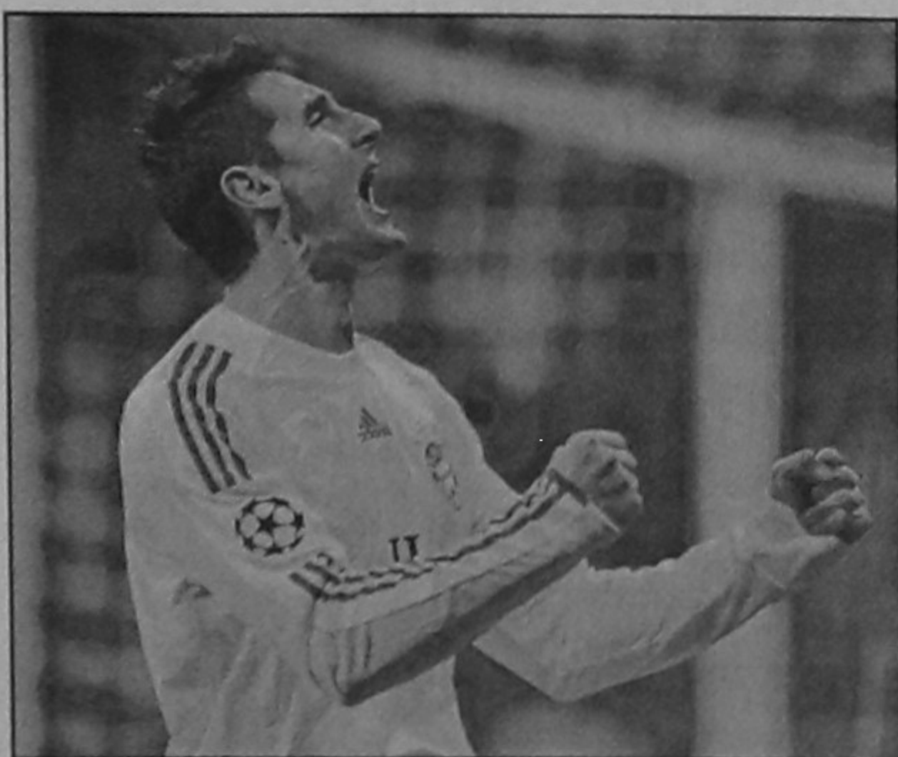
Bayern Munich striker Miroslav Klose is ecstatic after scoring the opening goal against Steaua Bucharest during their Champions League clash in Munich on Tuesday.

"I was attacking nobody, that was not what I wanted to do at all."