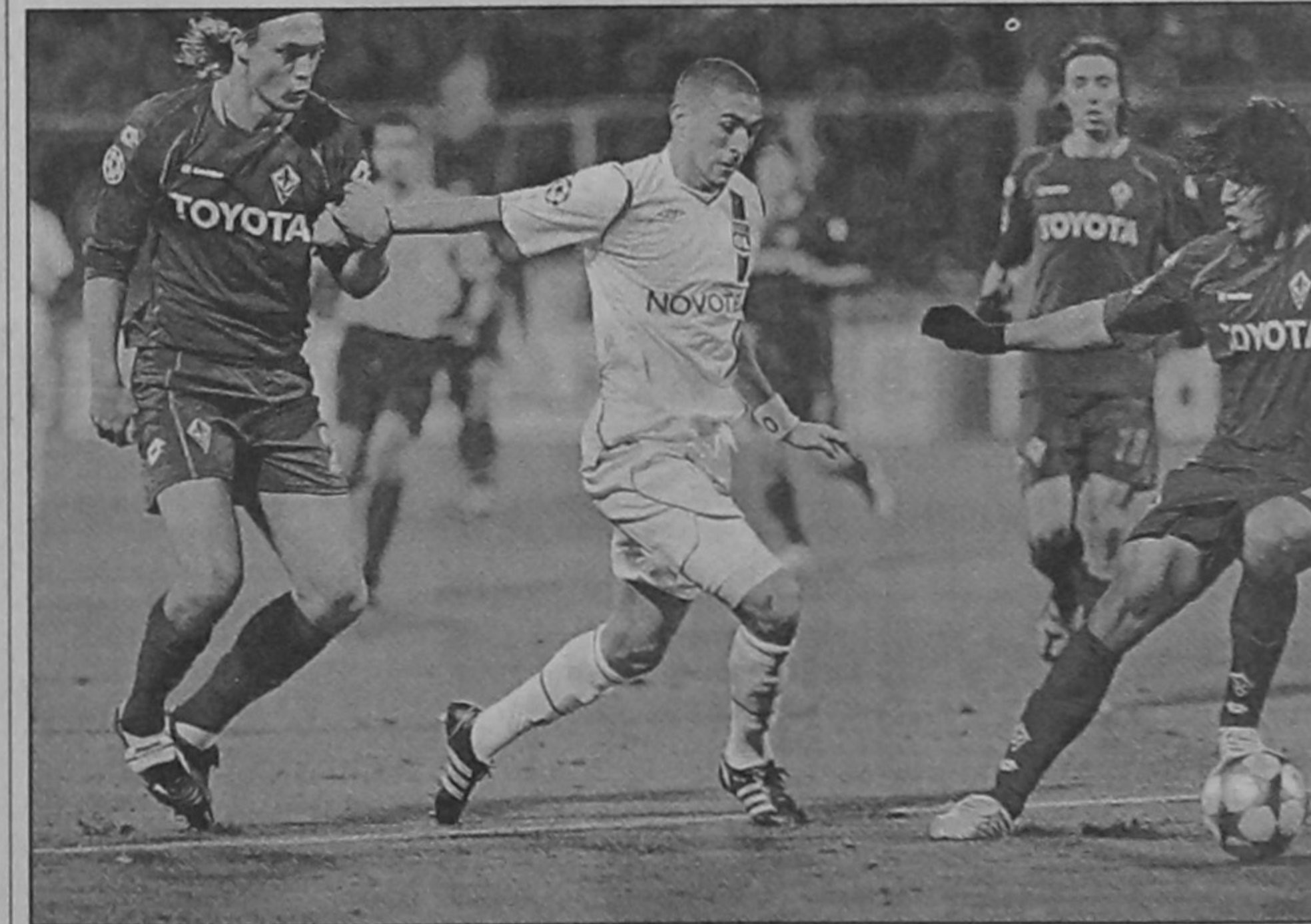
Lyon star Karim Benzema (C) battles his way through Fiorentina players during their Champions League match at the Artemio Franchi Stadium in Florence on Tuesday.

Several days after the Uruguay victory, Argentina lost to Chile for the first time in 35 years and that prompted then coach Alfio Basile to be removed from his post.