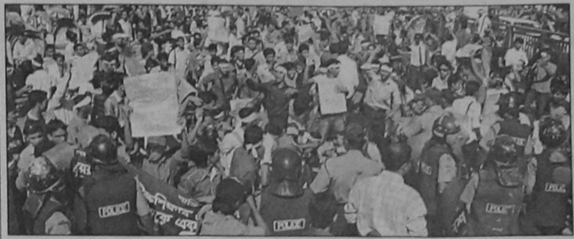
Dhaka College students stage a demonstration on the Mirpur Road in the city yesterday demanding steps to turn the college into a full-fledged university.

Contributions can be sent to Savings A/C No. 11944, Janata Bank, Ashashuni branch, Satkhira. Interested persons can also call at 01739004615 to contact his family for further information.