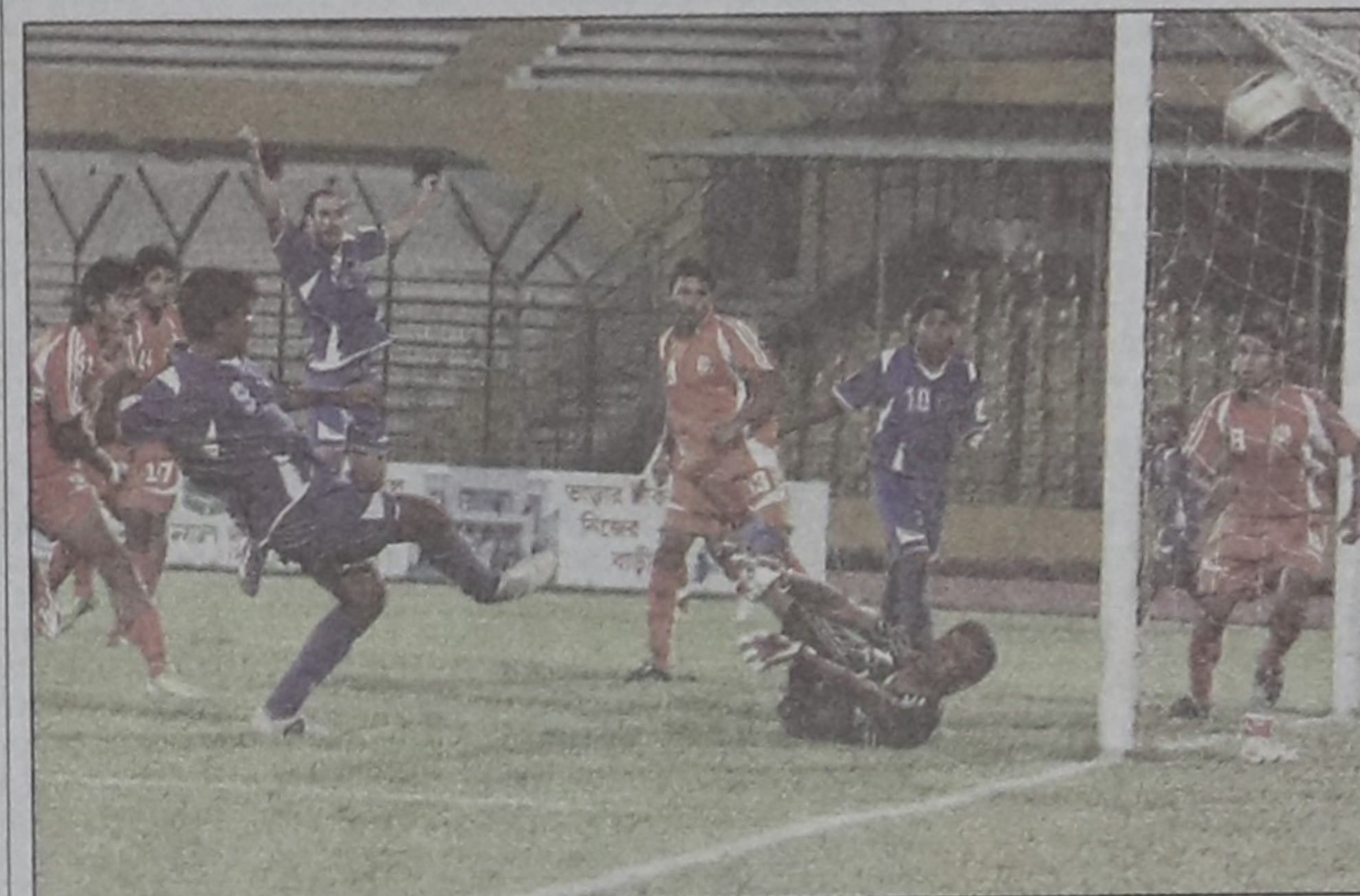
Striker Bulbul (No. 9) scores the opening goal for Sheikh Russel in their Citycell B. League match against Brothers Union at the Bangabandhu National Stadium yesterday.