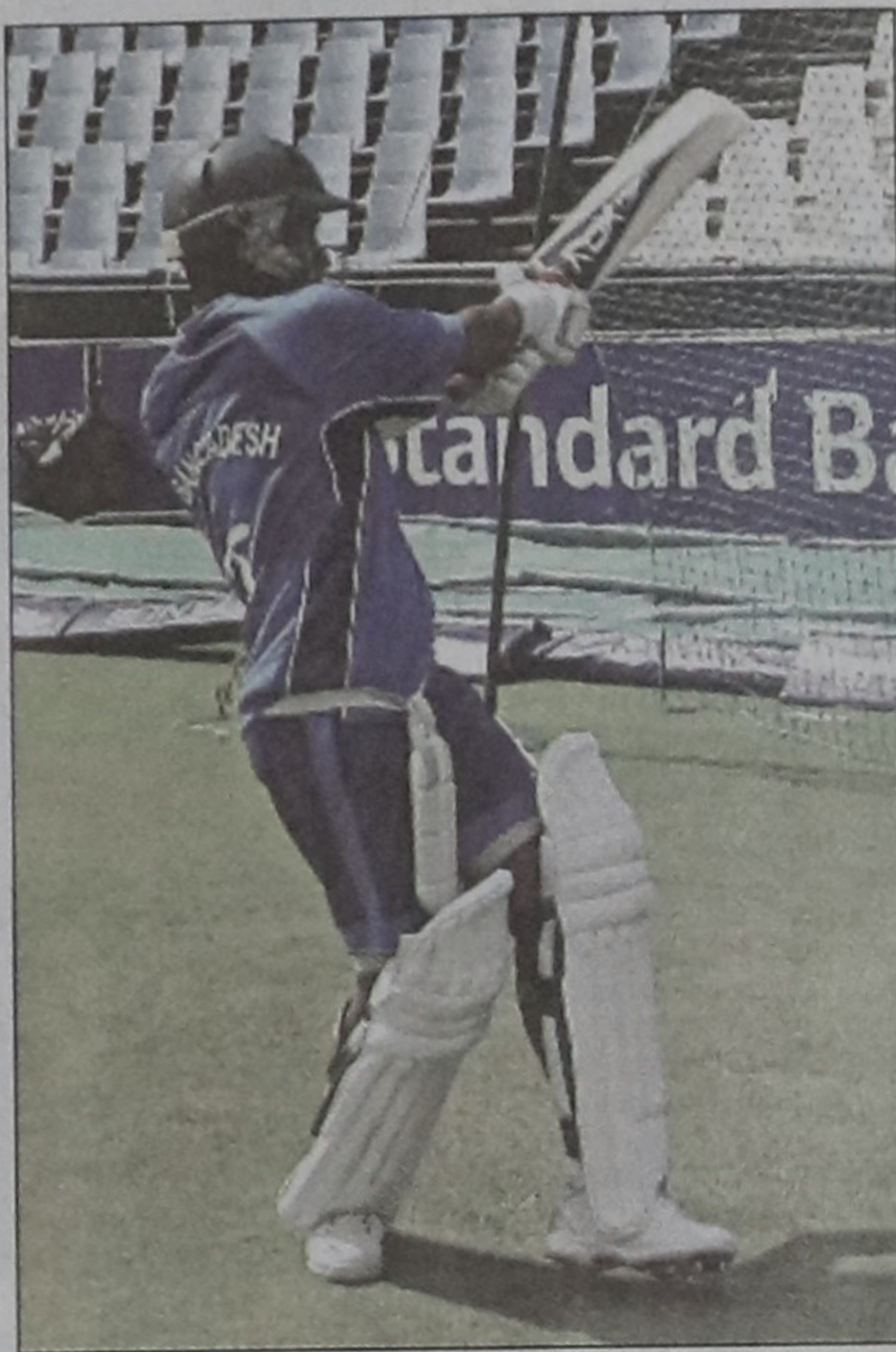
Mohammad Ashraful works on his horizontal bat shots at Super Sport Park yesterday ahead of today's second Test against South Africa.