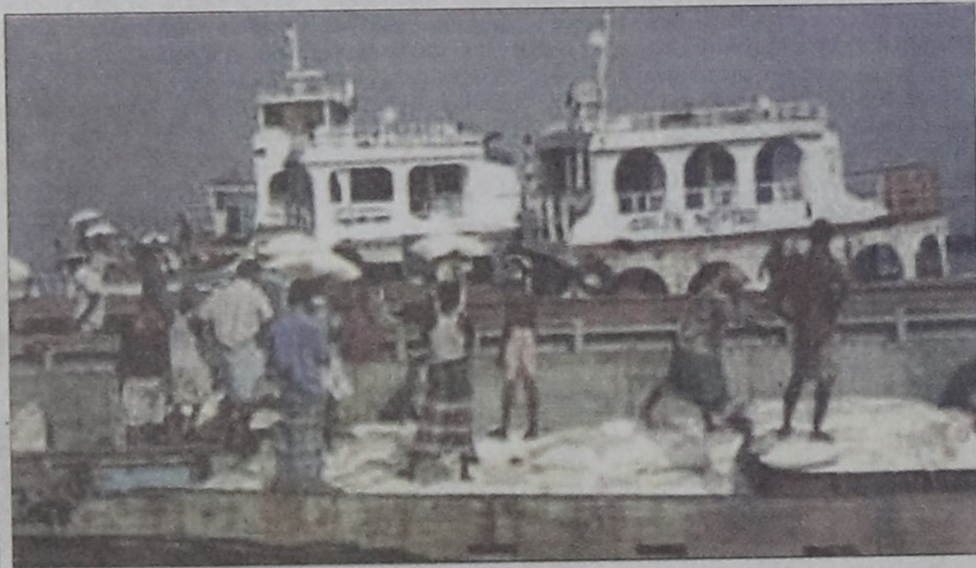
Fertiliser being unloaded from a stranded vessel at Nakalia in Jamuna River yesterday as 13 fertiliser laden ships got stuck in the area following drastic fall of water level.

BIWTA officials, however, claimed that their specialists and engineers are conducting dredging work in the proper way.