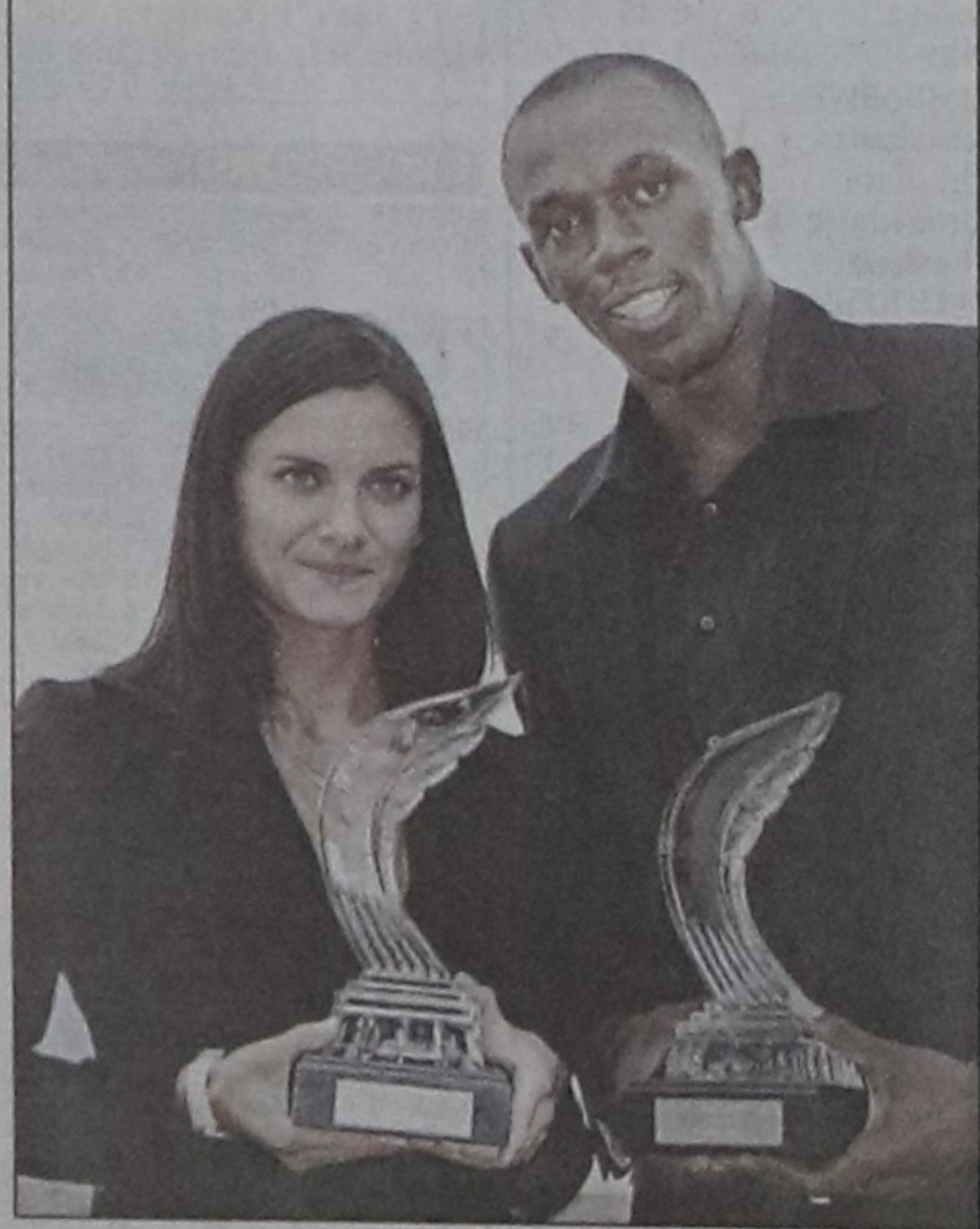
Russian pole vault queen Yelena Isinbayeva (L) and Jamaican sprint sensation Usain Bolt pose with their respective IAAF athlete-of-the-year trophies in Monaco on Sunday.