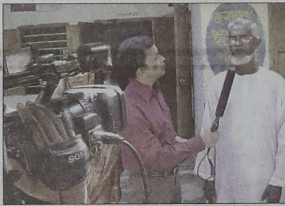
The show features public opinion on local government.

The show highlights government policies and issues related to Union Parishad, Municipality, City Corporation, Upazila and others. Public opinion on these issues will also be featured on the show. Centre for Development Communication has produced the programme.