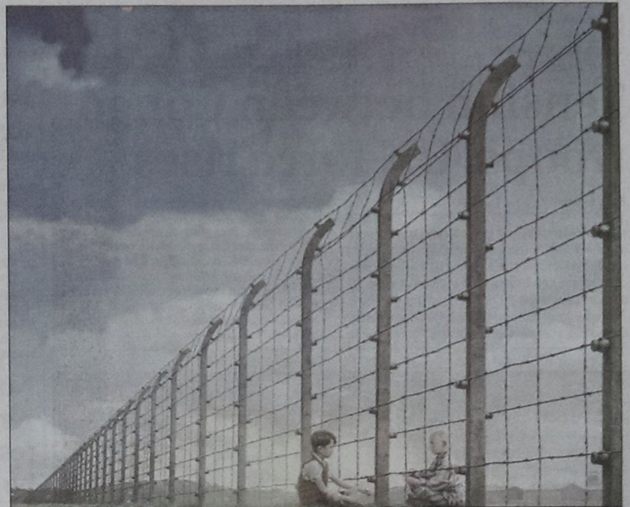
Poster of the film "The Boy in the Striped Pajamas"

The number of Holocaust-related memoirs, novels, documentaries and feature films in the past decade or so seems to defy quantification, and their proliferation raises some uncomfortable questions. Why are there so many? Why now? And more queasily, could there be too many?