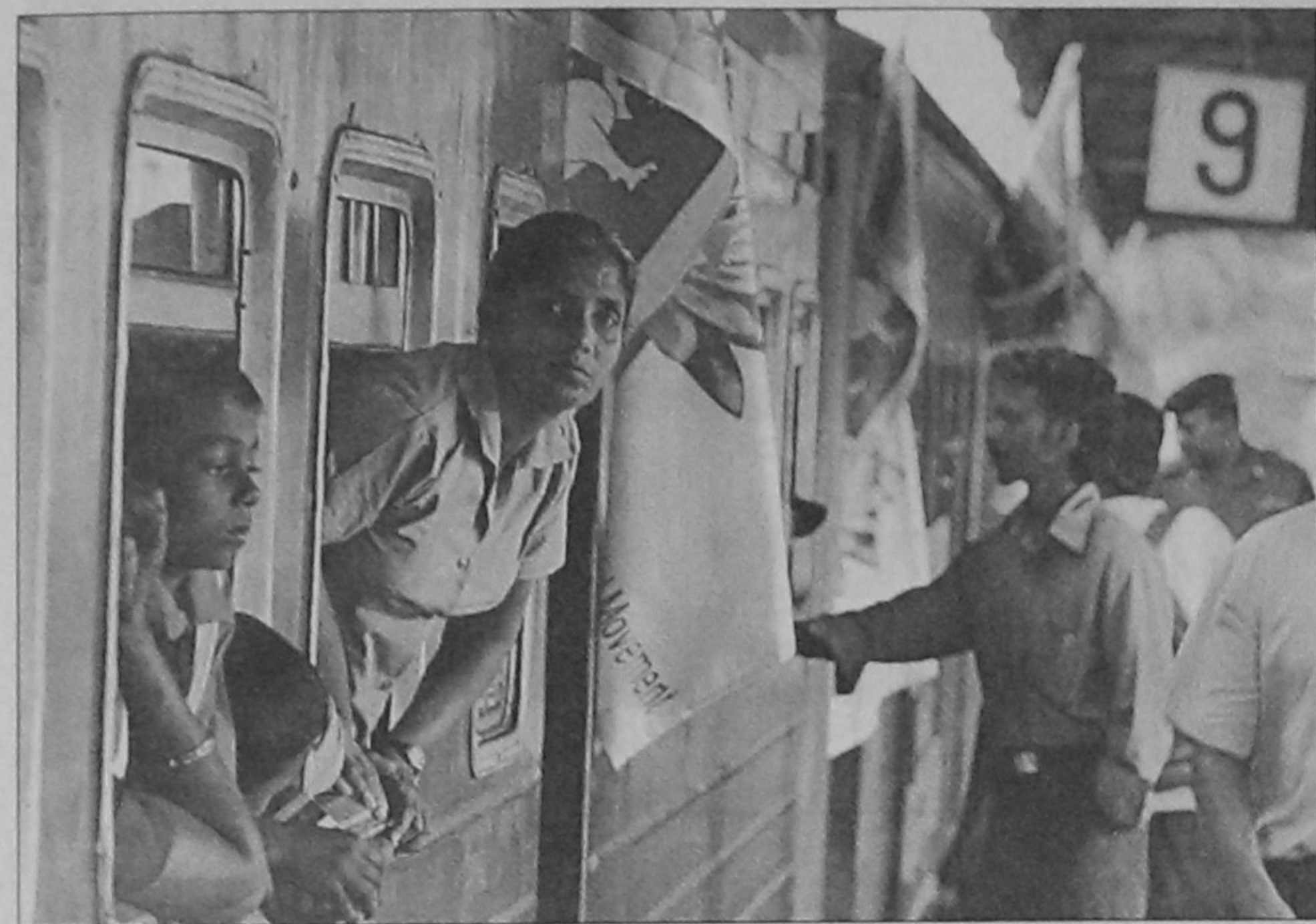
A Sri Lankan passenger looks out of a train in Colombo yesterday, transporting food supplies and aid for troops and civilians to the island's embattled north. Government forces are on a major offensive to dismantle a de facto state of Tamil separatists in the north.