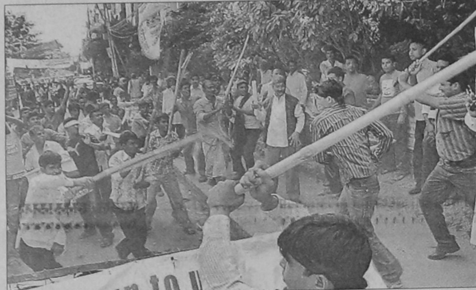
Supporters of two Awami League leaders who did not get party nomination clash near Sudha Sadan at Dhanmondi in the city yesterday.

A Qurankhwan and milad mahfil will be held at her village home in Ullapara.