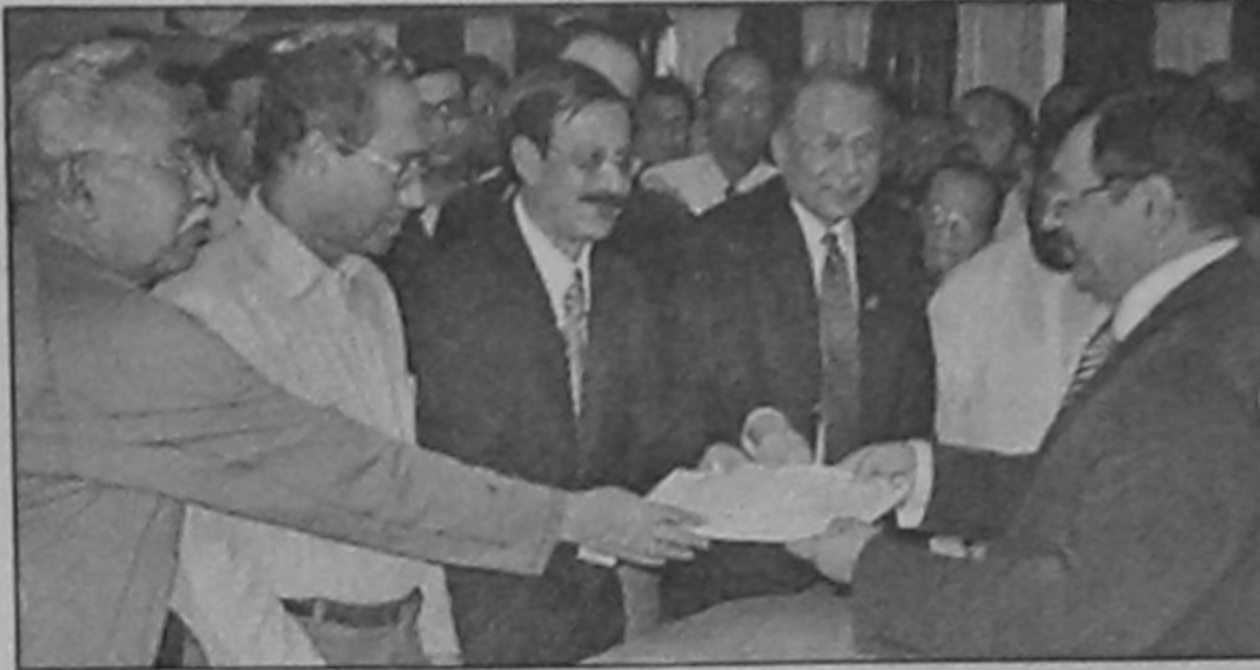
Sheikh Fazlul Karim Selim submits nomination papers for Awami League President Sheikh Hasina for Gopalganj-3 constituency to a returning officer in Gopalganj yesterday.