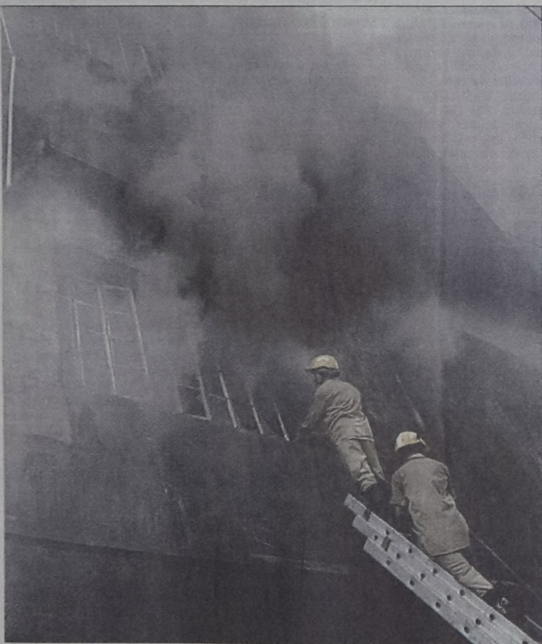
Two firemen ascend a ladder to pump water into the burning Apollo Garments warehouse at Asadganj in Chittagong yesterday as plumes of smoke cover the sky.