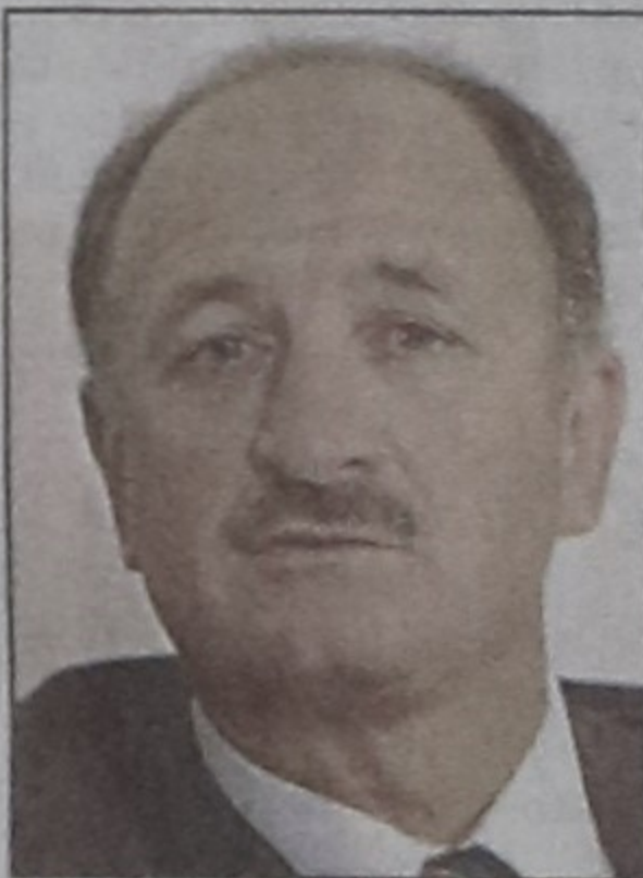
Luiz Felipe Scolari (Chelsea manager) "He is a player who is very professional and who I like to work with." On Michael Ballack.