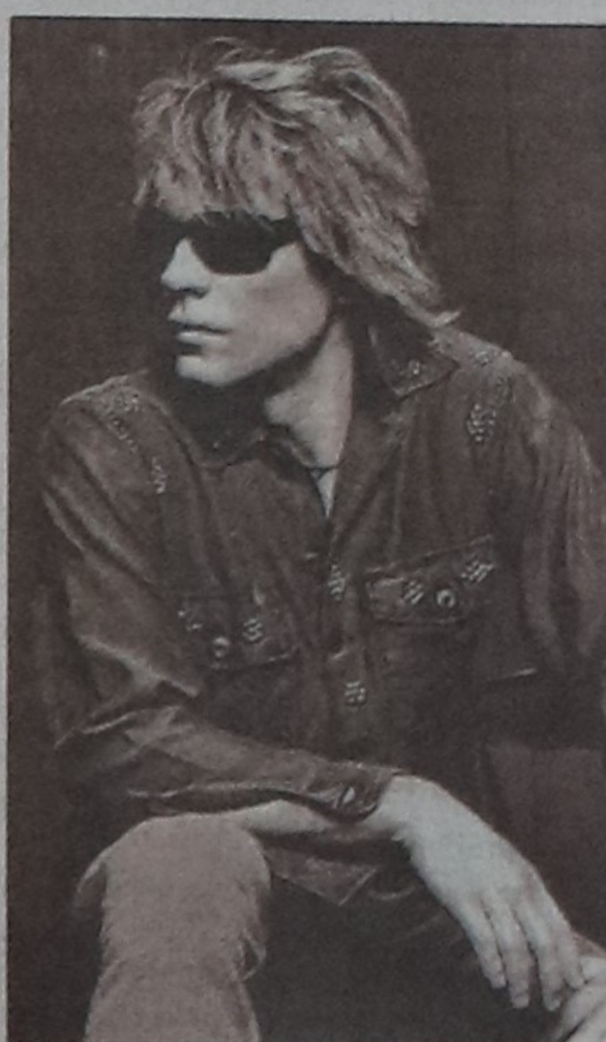
Jon Bon Jovi

includes Anoushka Shankar, Abhishek Bachchan, Aishwarya Rai Bachchan, Hrithik Roshan, Preity Zinta, Bipasha Basu, Shiamak Davar and Farhan Akhtar, among several others.