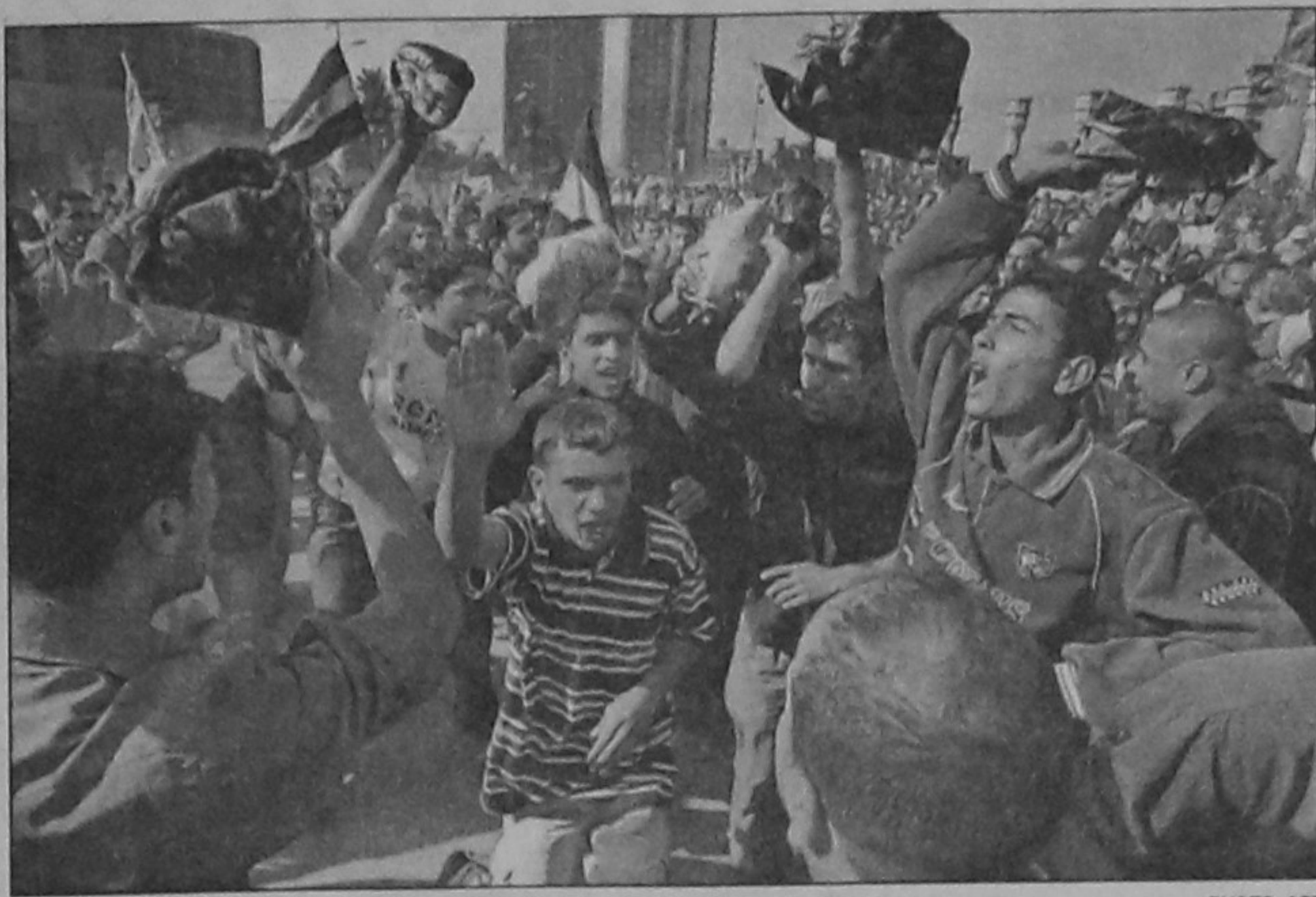
Thousands of mainly Shia Muslims protest following Juma prayers in Firdoos Square in central Baghdad yesterday. Thousands of Iraqi followers of the firebrand anti-American cleric Moqtada al-Sadr gathered in Baghdad to protest a security accord that would allow US troops to remain in Iraq until 2011.

impoverished coastal strip. The envoy of the Middle East diplomatic Quartet, made up of the European Union, Russia, the United Nations and the United States, Tony Blair, urged Israel on Friday to reopen the border crossings immediately. "The immediate reopening of Gaza for the regular entry of essential humanitarian and commercial goods, including fuel, food and medicines is vital," the former British prime minister said. Israel had been expected to significantly ease its blockade after a truce went into effect in June. It argues that militant attacks have made this impossible but Hamas accuses it of breaching the deal. Blair said it was vital that the truce continue. "The calm agreed on June 19th has been crucial in providing much-needed security for the people of southern Israel as well as for the people of Gaza and must be maintained."