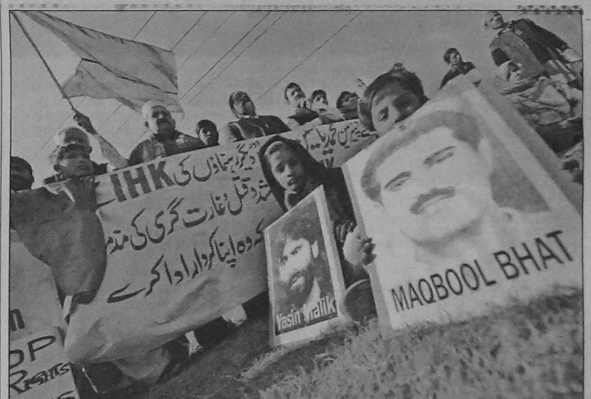
Children (foreground) pose with placards as Pakistani Kashmiris protest near the United Nations office in Islamabad yesterday against the arrest and harassment of pro-separatist Kashmiri leaders in Indian-administered Kashmir. Indian authorities have detained more than two dozens prominent separatists and scores of activists to prevent demonstrations against state elections being held in Indian Kashmir.

Two other men in their 20s were wounded and remain in intensive care, the Times of India reported.