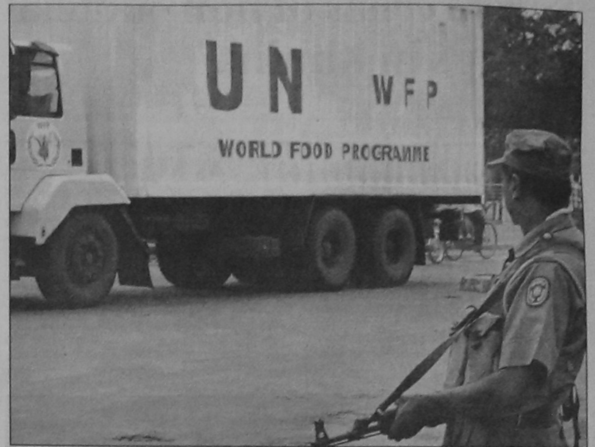
A Sri Lankan policeman stands guard in the northern town of Vavuniya yesterday as a UN food convoy travels through the town towards Tamil Tiger rebel-held areas of the island. The UN and the International Committee of the Red Cross are pushing food and other supplies to the region where some 300,000 civilians are trapped by the ongoing fighting between government forces and Tamil Tiger rebels.

The three frontal military assaults at the central Kilinochchi battlefield led by troops of the 57 Division and Task Force 3 entered decisive phase at troops met resistance from LTTE, North of Kokavil, Murunkandy and North of Akkarayankulam yesterday.