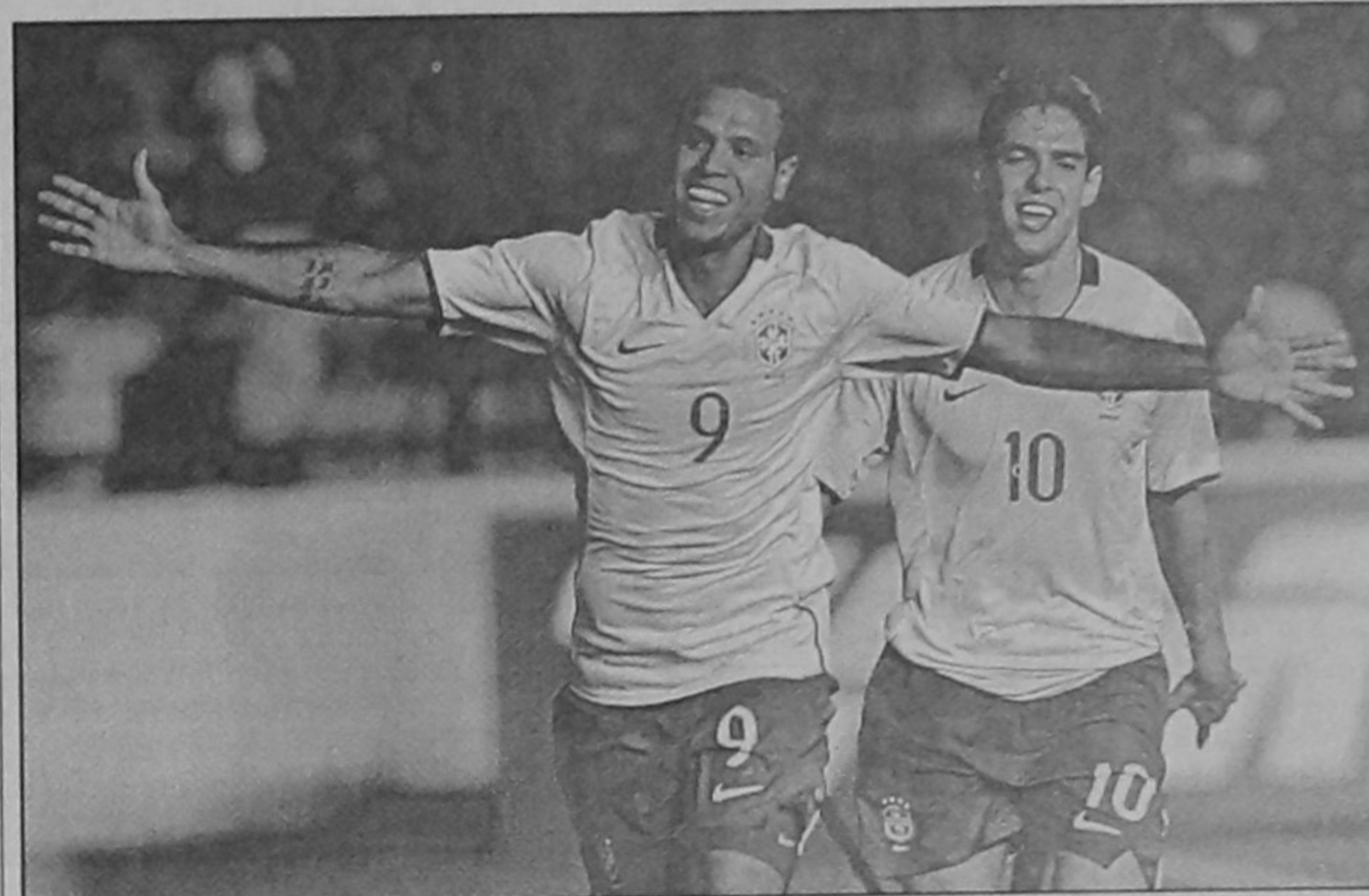
Brazil striker Luis Fabiano (L) celebrates with teammate Kaka after scoring the second goal against Portugal during their international friendly at the Bezerro Stadium in Brasilia on Wednesday. Fabiano scored a hat-trick to lead Brazil to a 6-2 thrashing of Portugal.

the national team's critics. "I think that from now on all Brazilians have to forget the critics and support this team," he said. "Today we played very good football. This is the right way. They scored their with their first chance but we showed that we had the capacity to fight back." Coach Dunga, meanwhile, paid tribute to the home crowd. "Brazil have very good players that play in the best clubs in the world and when people support them like they did today, they play this way," he said. "The fans forgot for a while all the doubts and cheered the players and they need that. They responded with a superb performance." Keeper Julio Cesar echoed his coach's comments. "We were indebted to our supporters because we haven't played well in our recent home games," he said. "Therefore this victory is for them and also helped us to finish the year well." Portugal coach Carlos Queiroz took responsibility for the defeat. "I'm the man responsible for this situation," he admitted. "All the squad are very frustrated by this result. But we are very united and we know we can recover." "I think we allowed too much space and Brazil took advantage of that. Some of the goals we let in were very poor." "We lost the concentration after Brazil scored their first two goals."