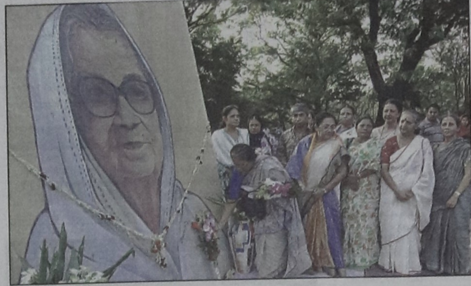
Women's rights activists place bouquets at the portrait of poet Sufia Kamal at Central Shaheed Minar in the city yesterday to pay homage to her on the occasion of her ninth death anniversary.

immediate execution of the trial of war criminals and hoped that the countrymen would boycott the criminals in the upcoming elections.