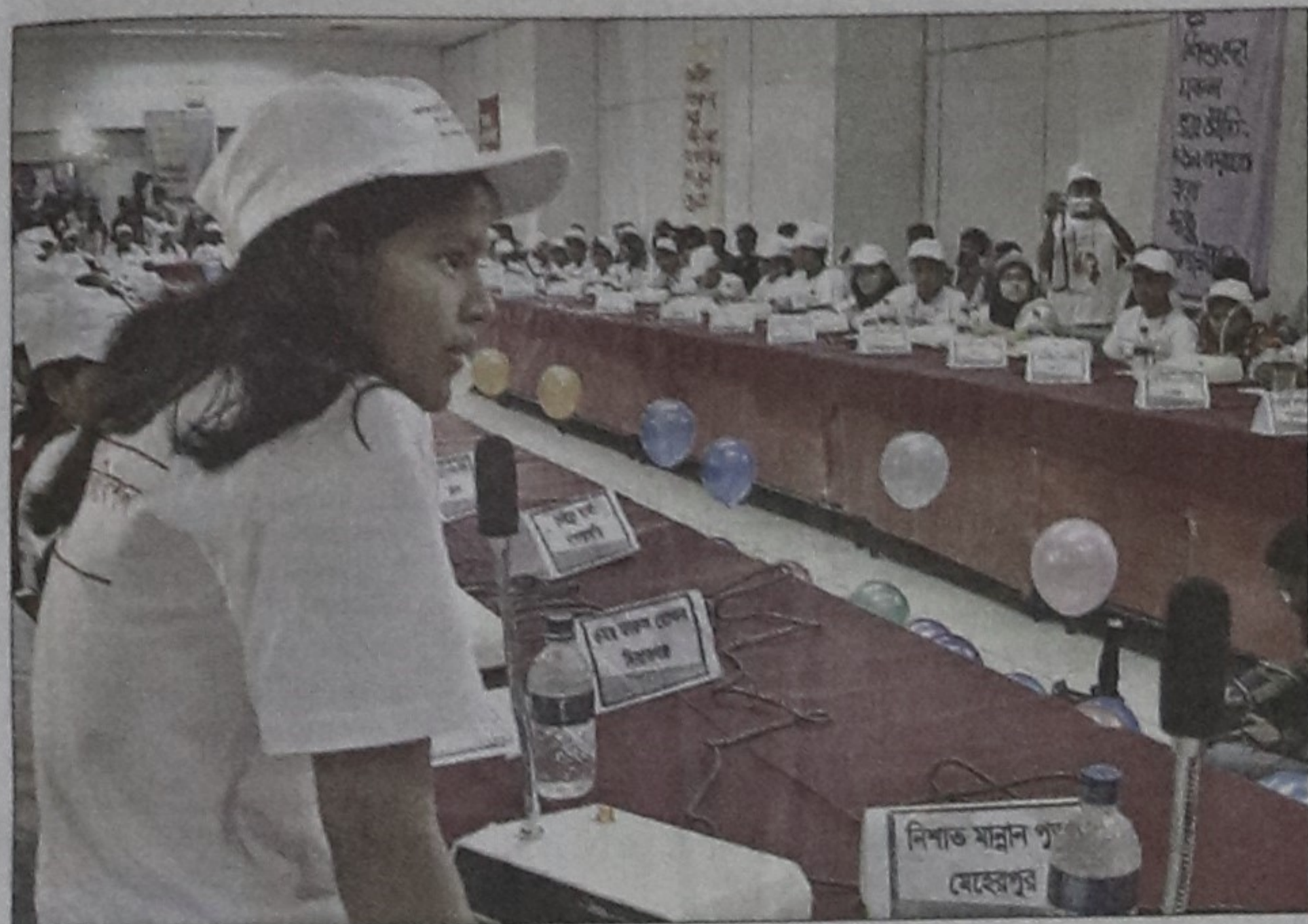
A child parliamentarian speaks at the Child Parliamentary Session 2008 organised to discuss the issue of the use of children in political activities at Biam auditorium in the city yesterday. Save the Children-Australia organised the event.