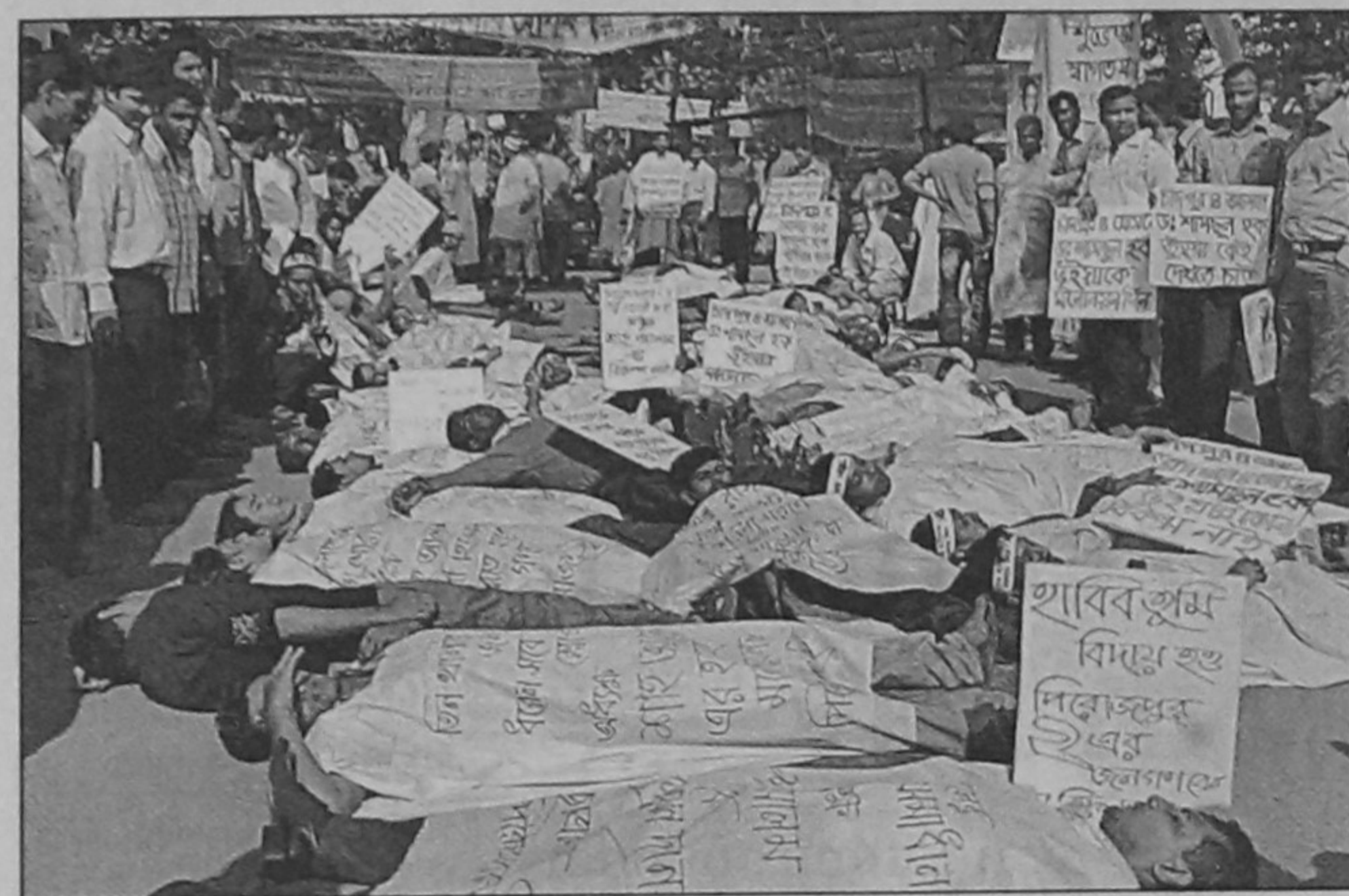
Staunch supporters of the deprived Awami League nomination hopefuls stage a demonstration in front of Sudha Sadan in the city yesterday.

Friends, admirers and freedom fighters are requested to attend the programme.