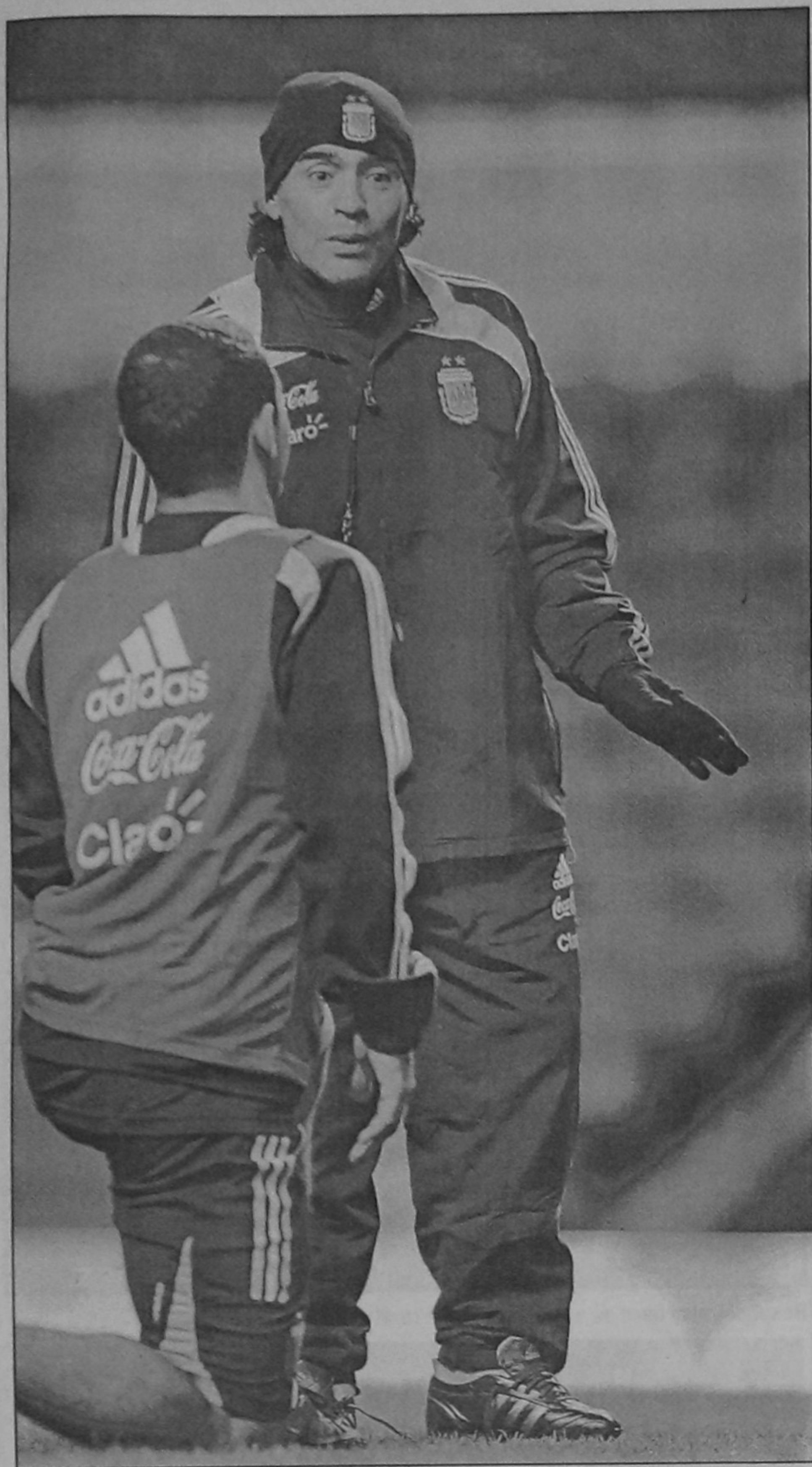
Argentina coach Diego Maradona (R) talks with team captain Javier Mascherano during a training session in Glasgow on Tuesday. Maradona's first game in charge is against Scotland tonight.