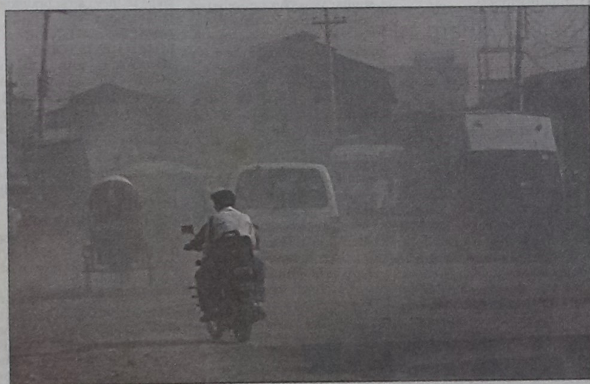
Dust and car emissions blur the view at Shyampur on Postagola-Naranyanganj road. The UN Environment Programme says brown clouds kill hundreds of thousands of people in the world, especially in Asia. The photo was taken yesterday.