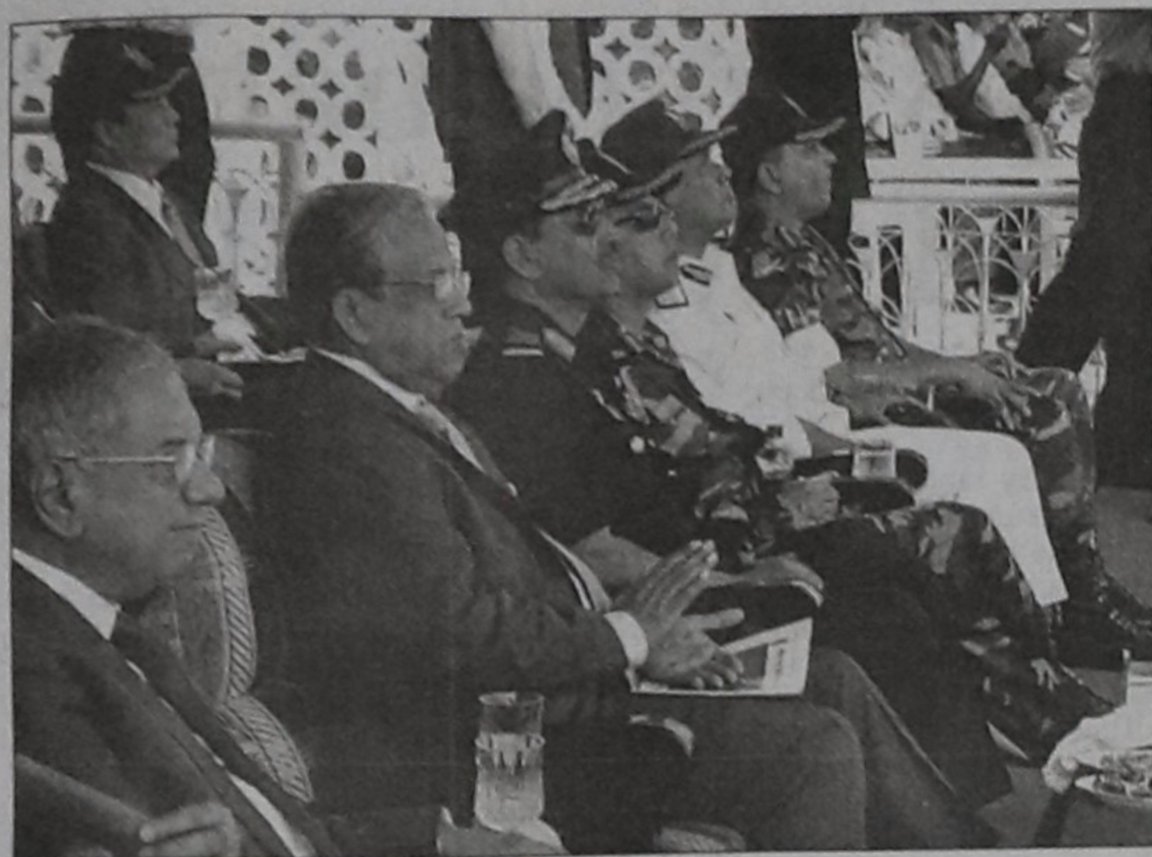
Chief Adviser Fakhruddin Ahmed witnesses a spectacular firing exercise of Bangladesh Air Force, 'Fire Power-2008', at the BAF Firing Range at Rasulpur in Tangail yesterday.