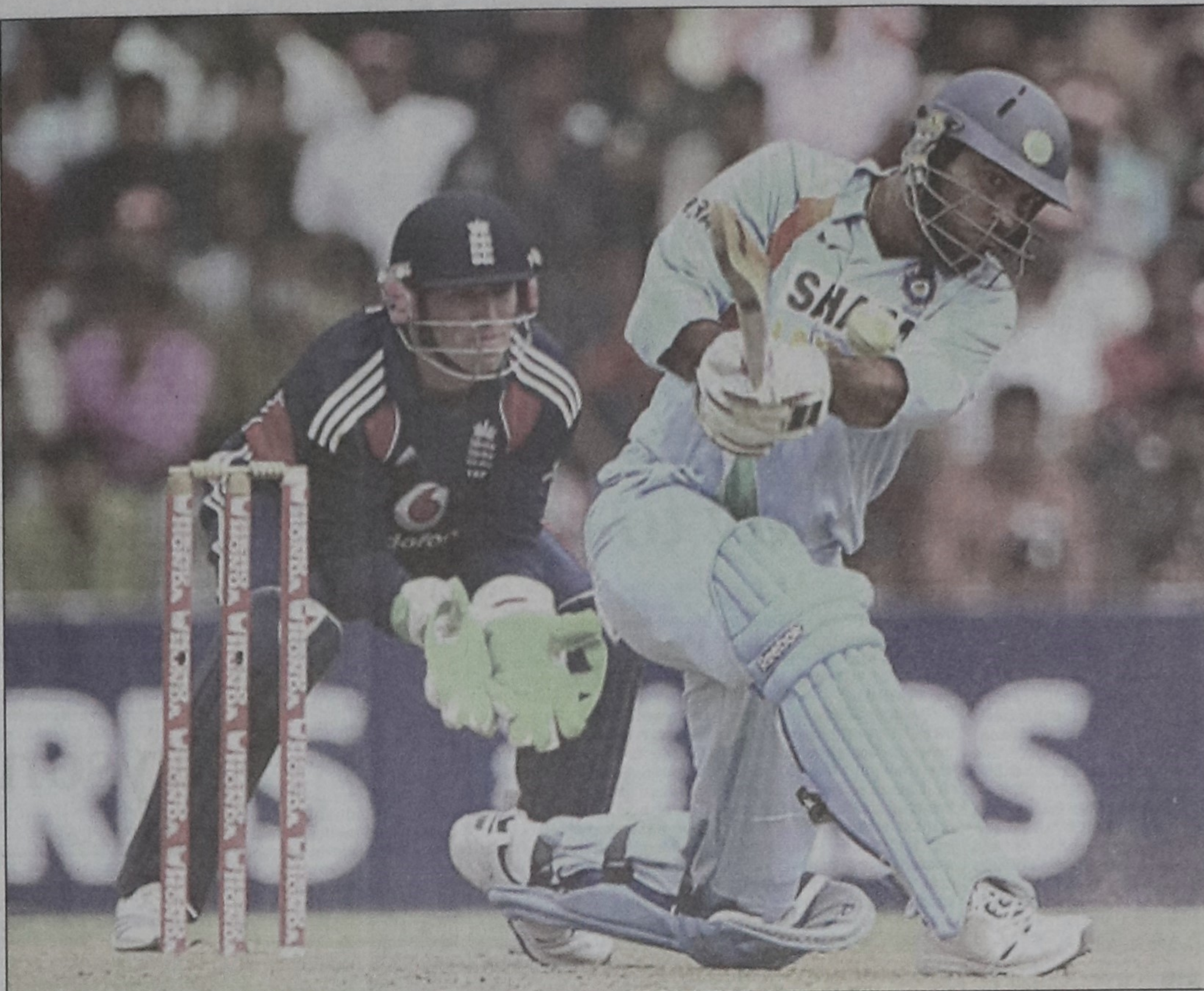
ENGLAND'S NEMESIS: Indian batsman Yuvraj Singh flays one over mid-wicket during a sublime knock of 118, his back-to-back century, against England in the second one-day international in Indore yesterday.