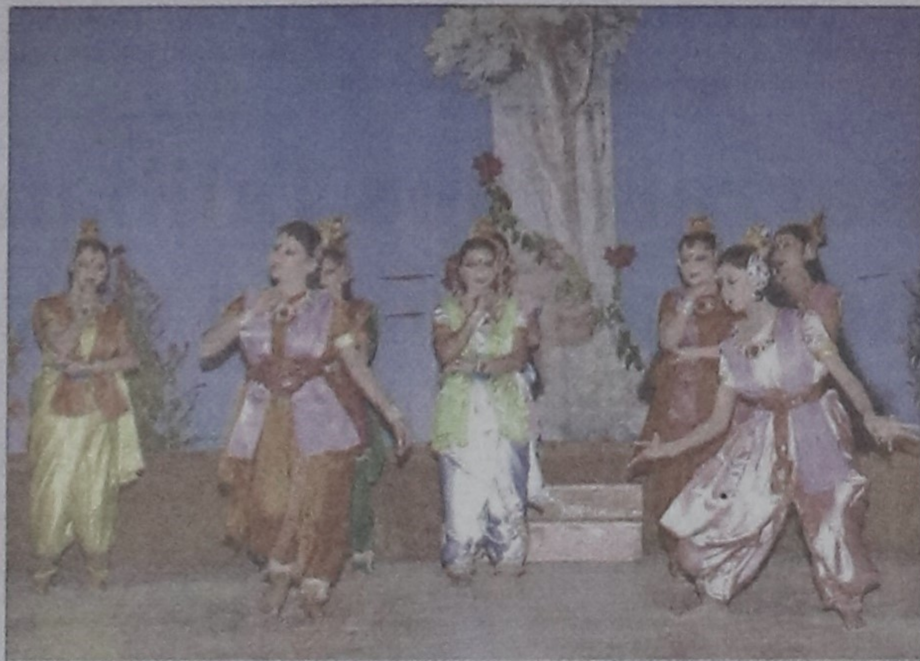
Students of Bharateswari Homes stage "Mayar Khela."