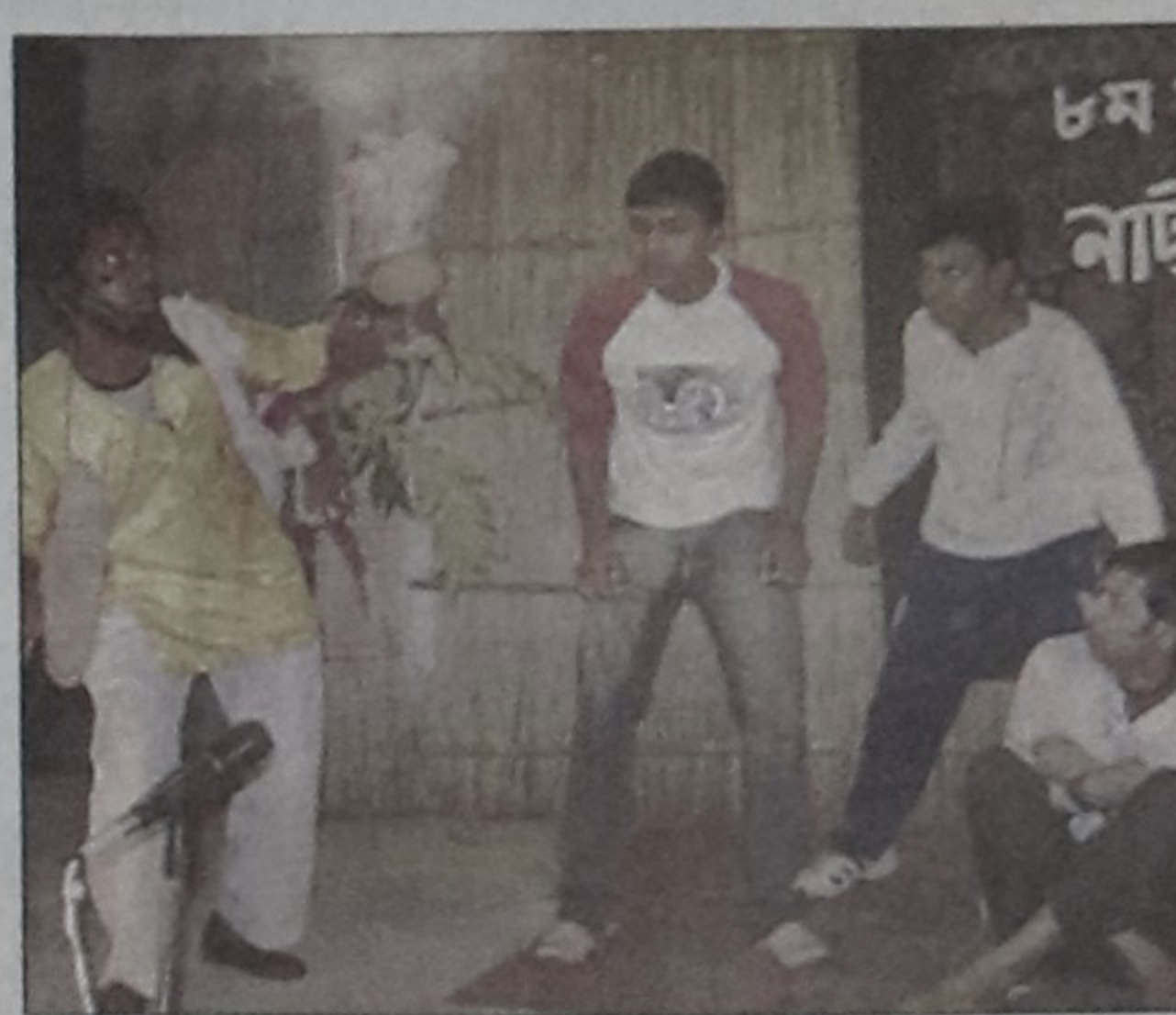
Actors perform at the Pabna Drama Festival.

Gonoshilpi Sangstha, artistes of Manobadhikar Nattya Parishad, Sangeet Niketan, Harijan Nattya Samproday and several other organisations performed plays at the festival. A highlight of the festival was a 'Jatrapala' "Ekti Paisa Dao," staged at the concluding programme.