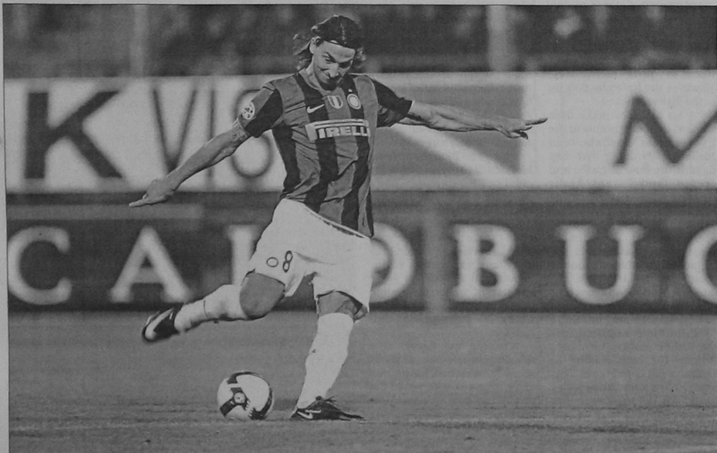
Inter Milan star Zlatan Ibrahimovic shoots to score his second goal against Palermo during their Serie A tie at the Barbera Stadium on Saturday.

"Some things were neglected," said Loew.