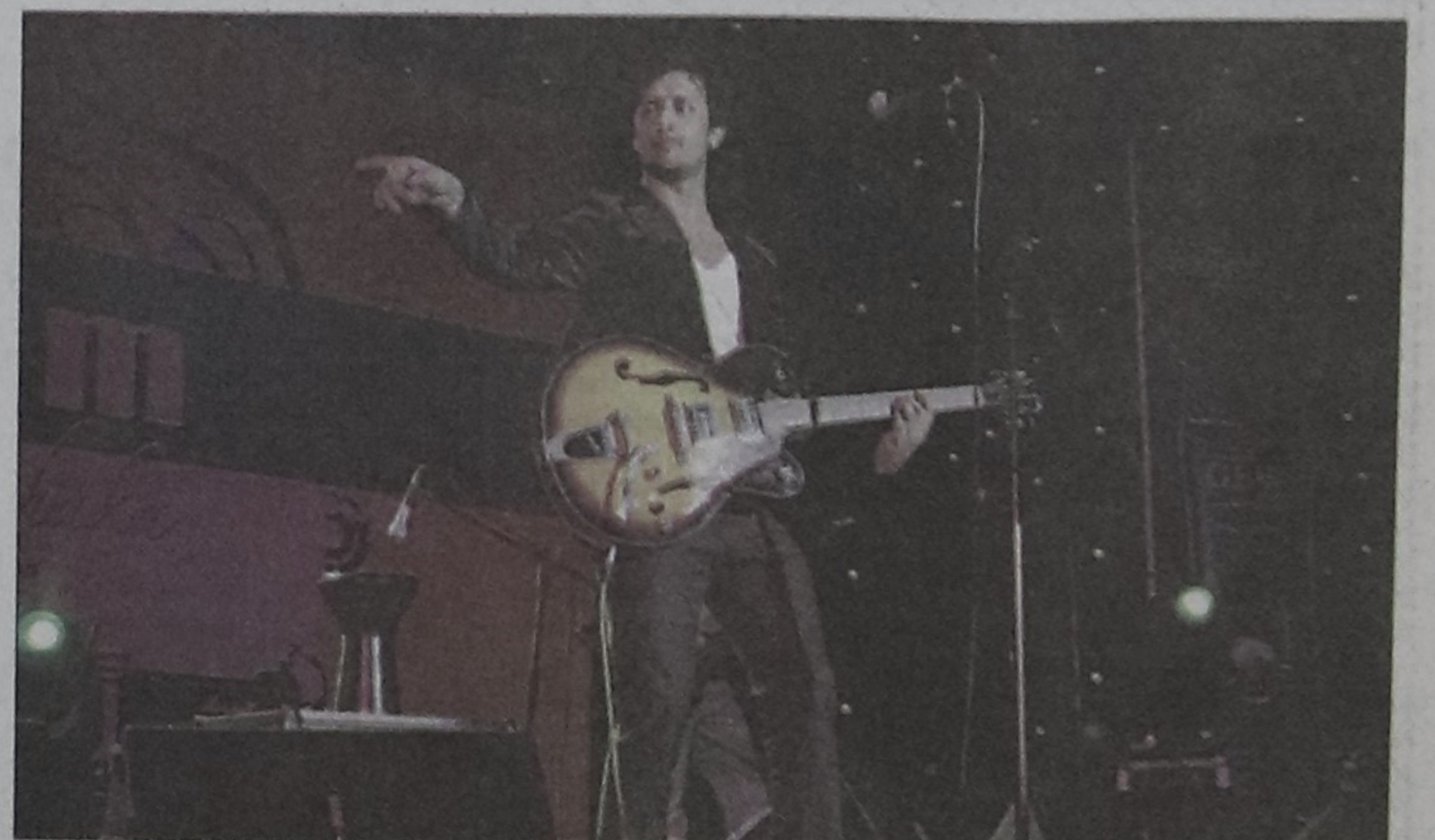
Atif Aslam in his element at the concert.

ATN Bangla, Radio Foorti, and Daily Ittefaq were the media partners of the event while Rage Audio and Neptune Advertisement Ltd were event partners.