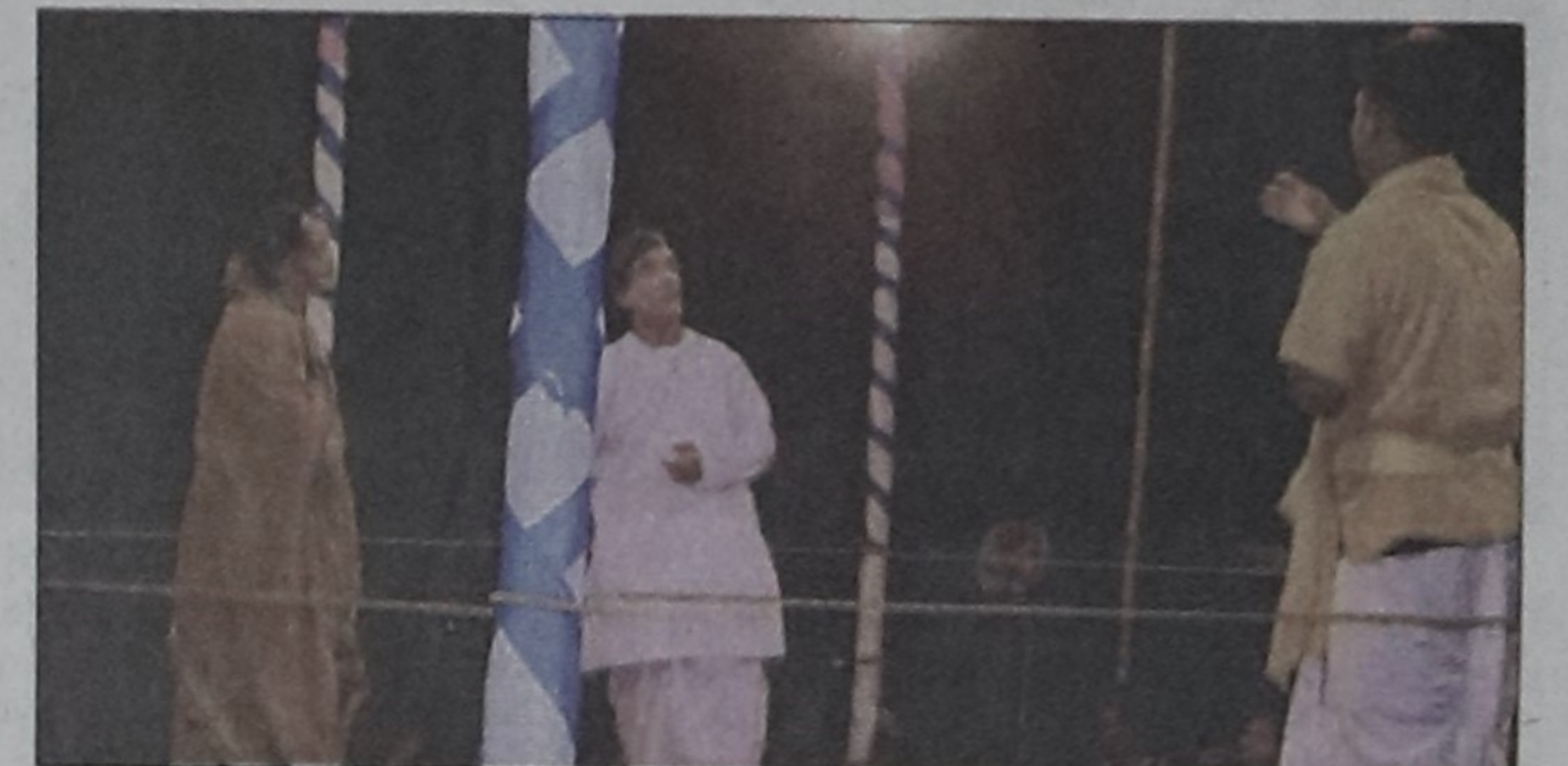
A scene from the play "Kolonkini Bodhu".