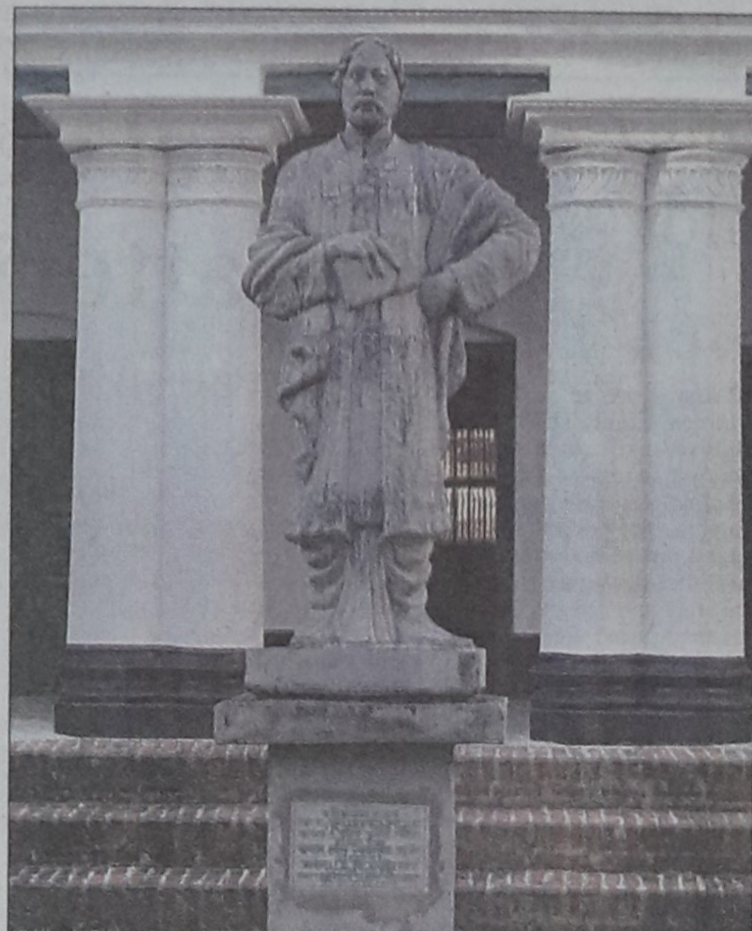
A recently installed statue of Tagore at Potisar Rabindra Kacharibari in Naogaon.