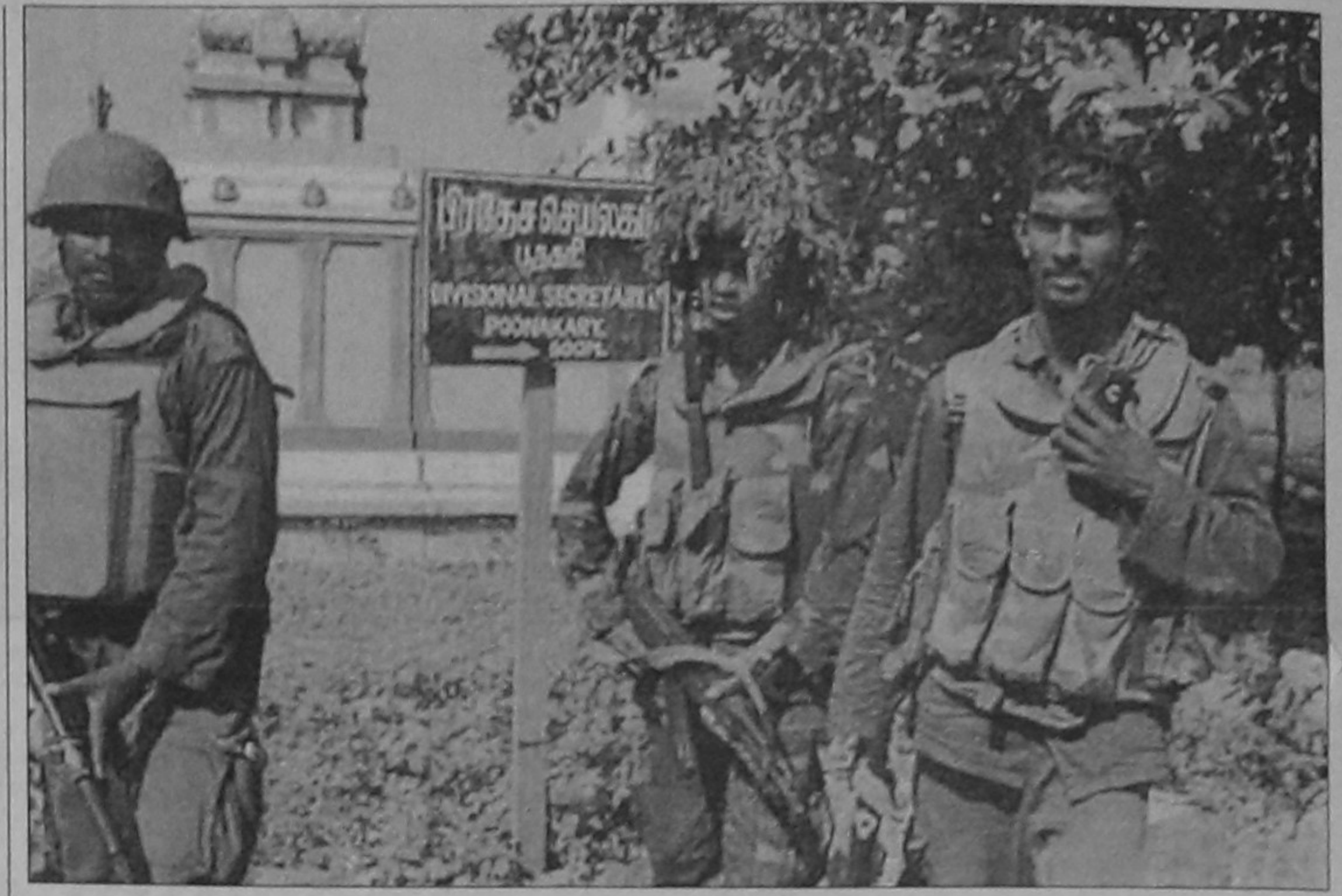
This handout picture from Sri Lanka's Defence Ministry dated Saturday shows government troops at the strategically important town of Pooneryn which the military said was wrested from rebel control on that day after months of heavy fighting.