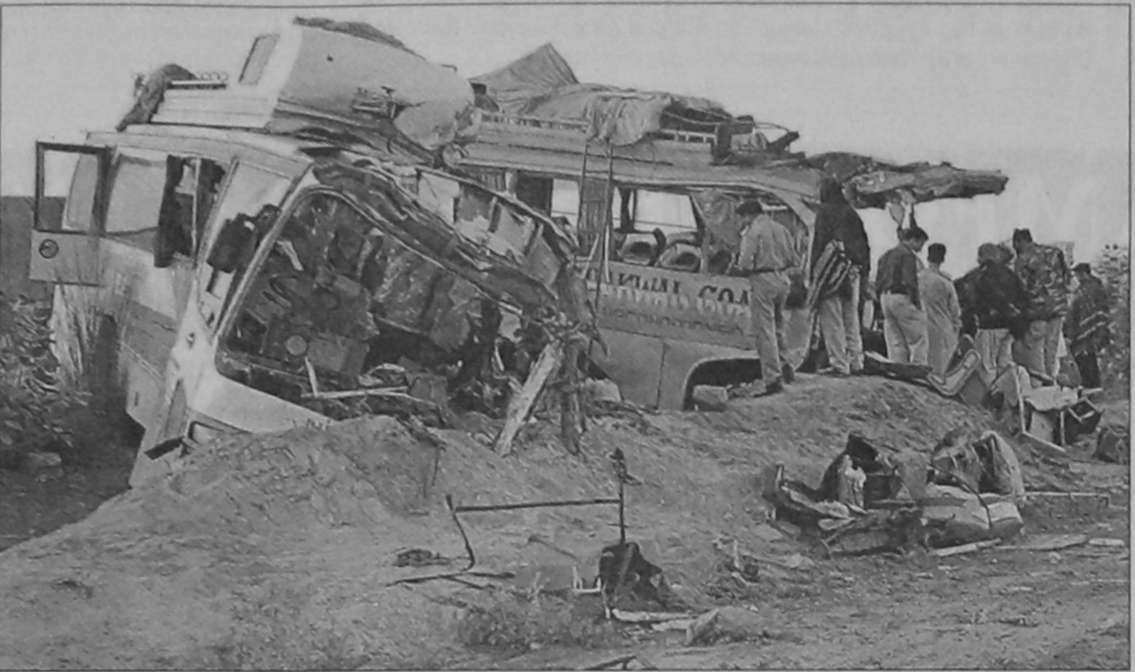
Pakistani security officials inspect the crashed buses after an accident in Khairpur yesterday. At least 18 people were killed and 35 injured in a head-on collision between two passenger buses in southern Pakistan.