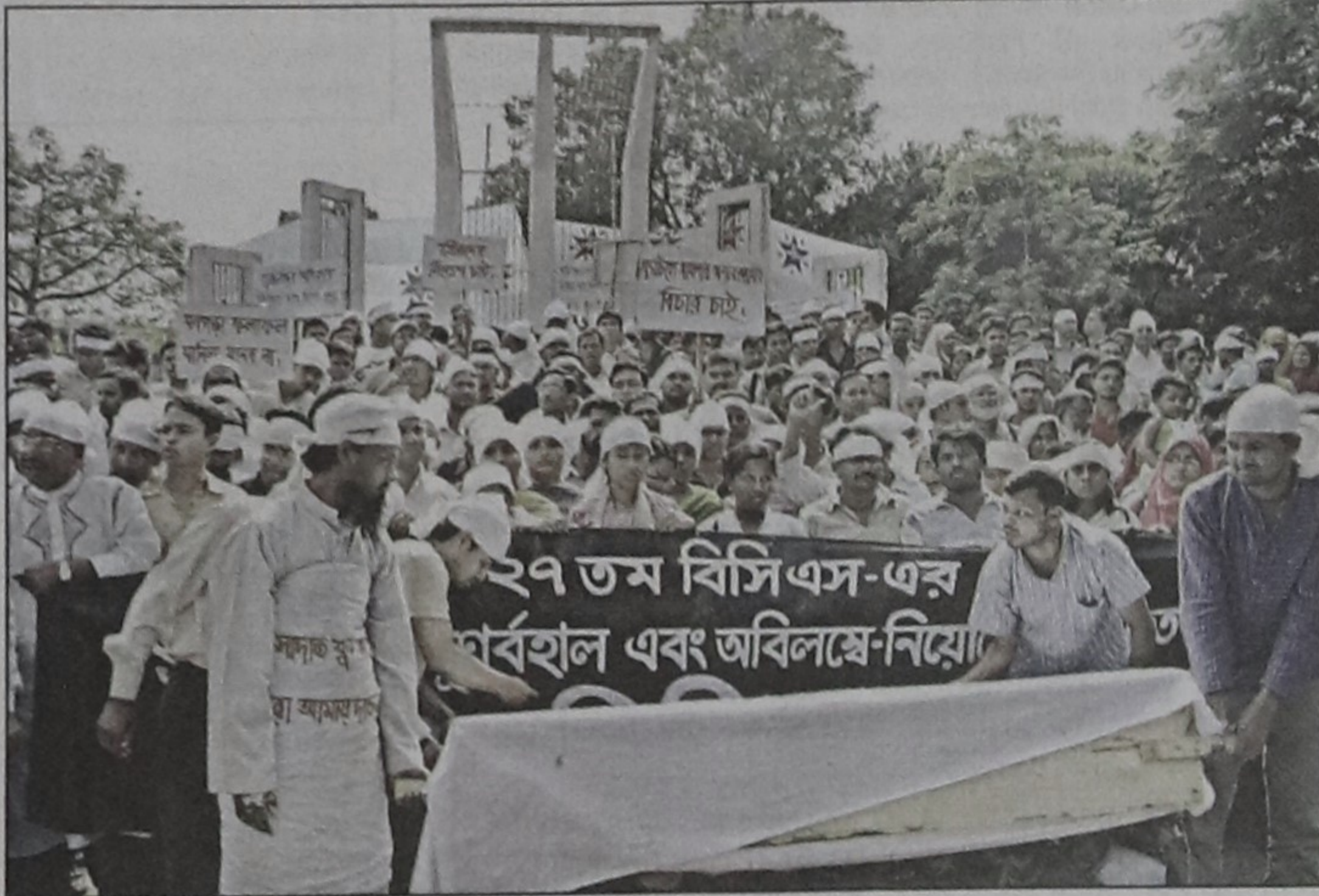
The candidates who passed the 27th BCS examinations at first but were dropped from the list of successful candidates as per the second phase results take out a procession with an empty coffin towards the office of the chief adviser from the Central Shaheed Minar yesterday demanding their immediate appointment.

According to the prosecution, a team of Rapid Action Battalion (Rab) raided Hafezia Madrasa at Forzakanda in Narayanganj district on January 7 last year. They recovered 21 grenade shells from there.